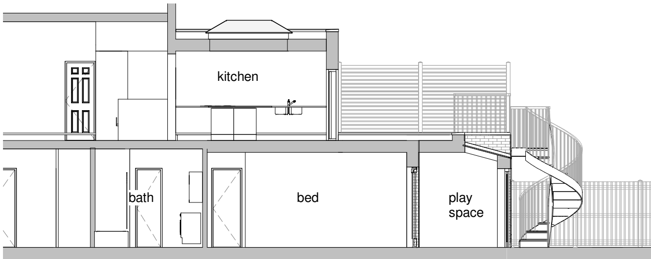
3 10.3 Transverse Section 01 - proposed p304 1 : 100