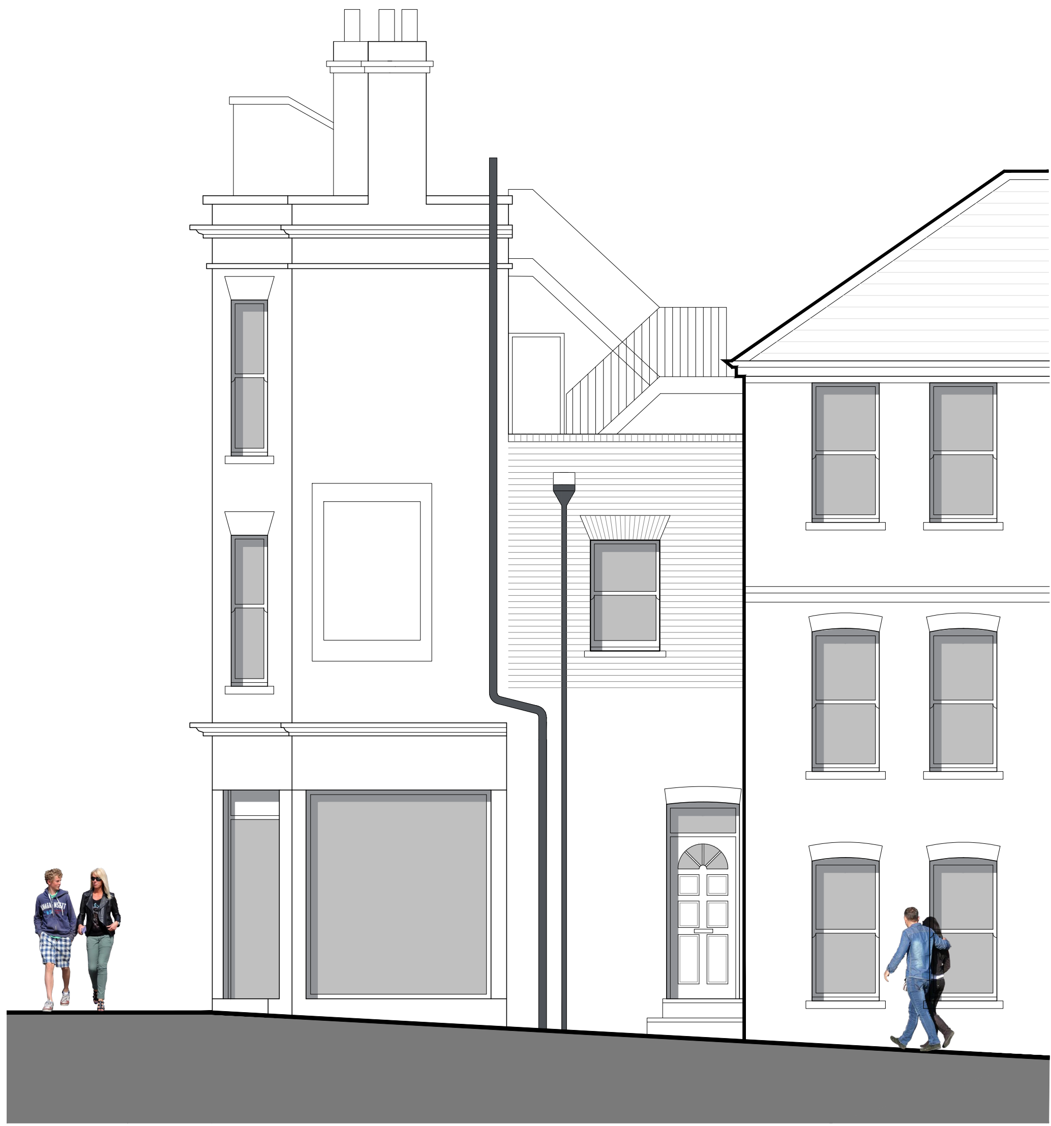
05 PERRIN'S COURT AS PROPOSED 1:50