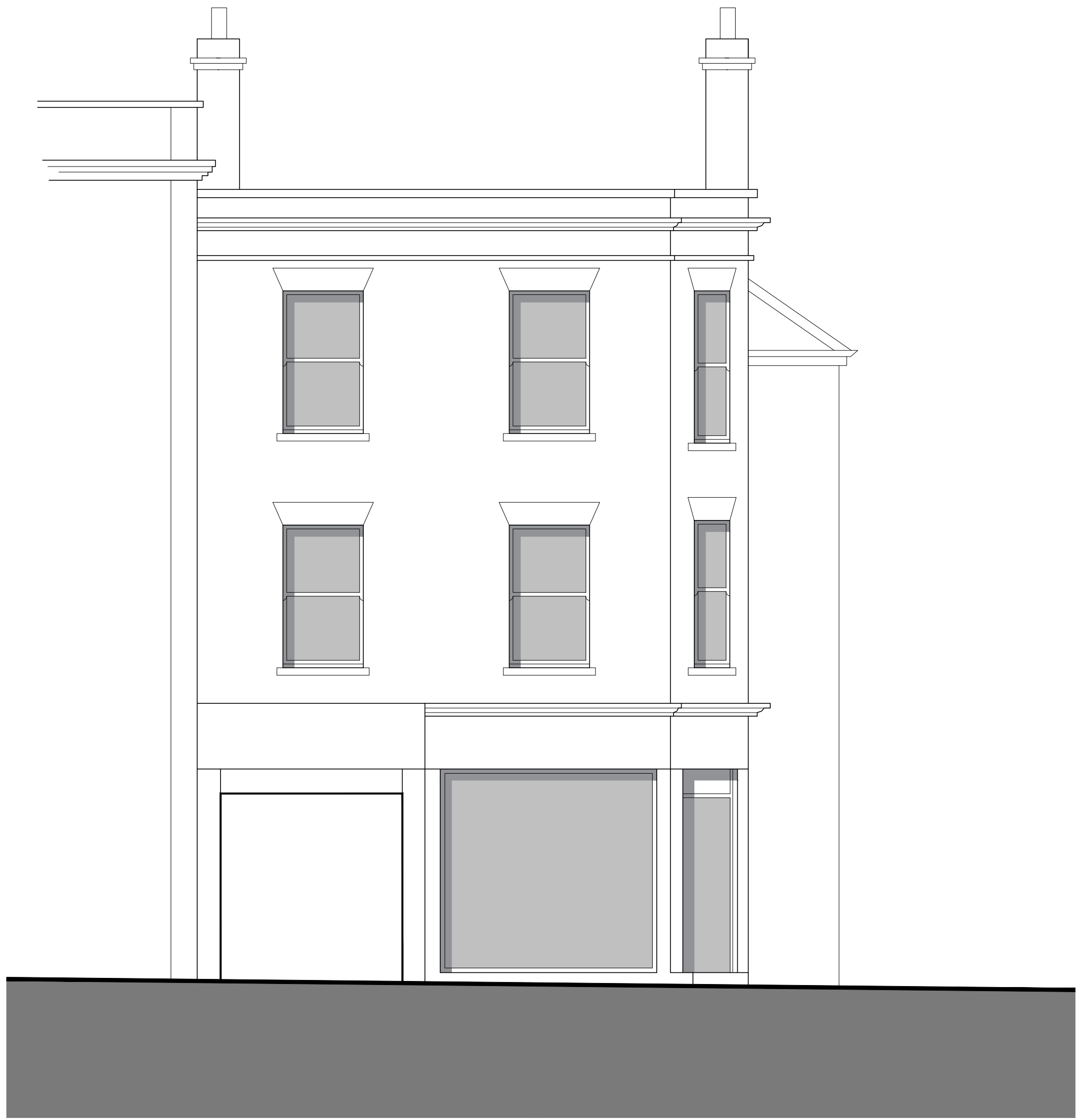
01 HEATH STREET AS APPROVED 1:50