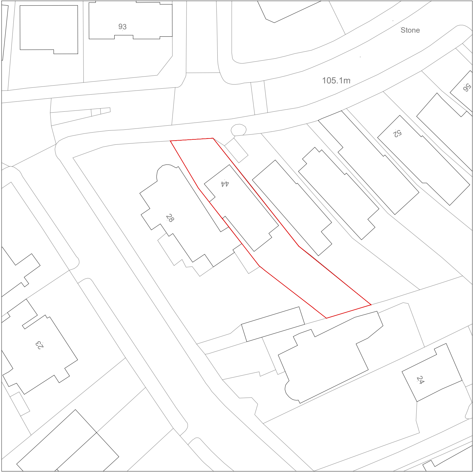
02 Drawing 02 - Site Plan Scale 1:500 @ A1