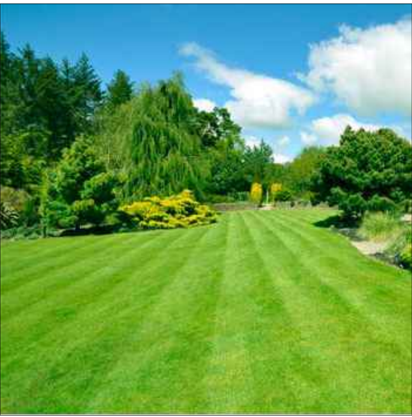
Sample of Turf