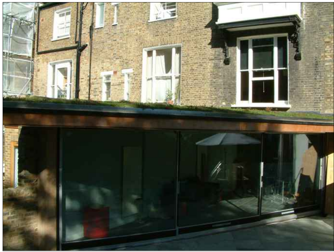
Sample of Green Roof