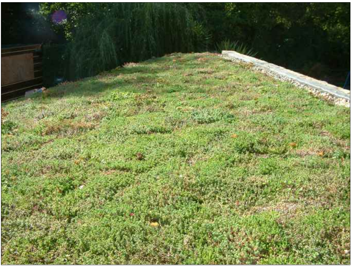
Sample of Green Roof