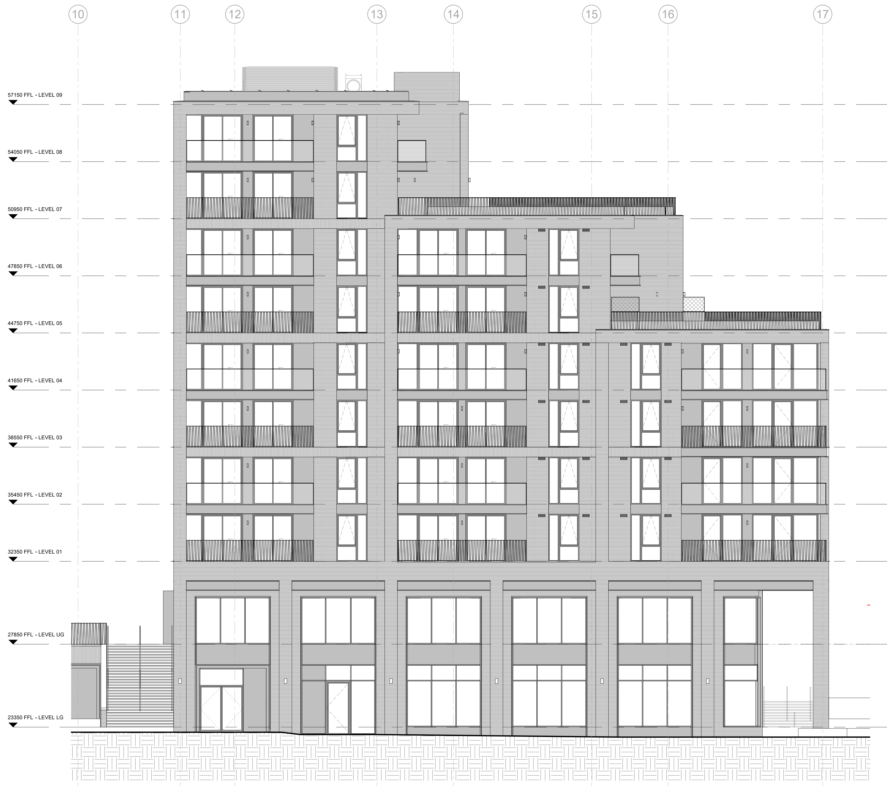
South Block - SW Elevation