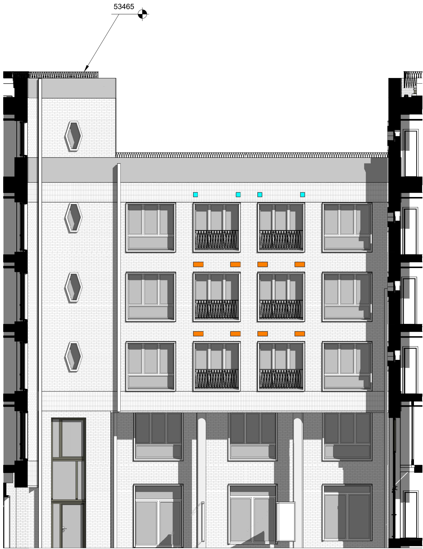
4 South Elevation (Courtyard) - Planning 1 : 100