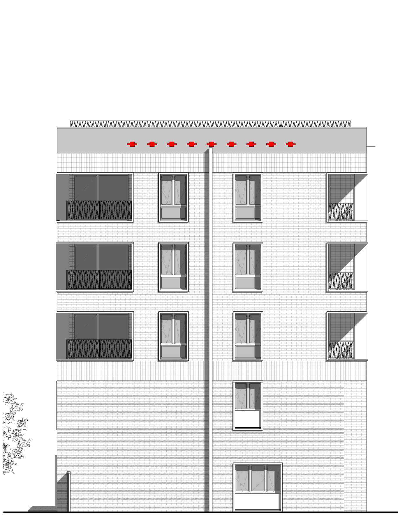
1 East Elevation (Courtyard) - Planning 1 : 100