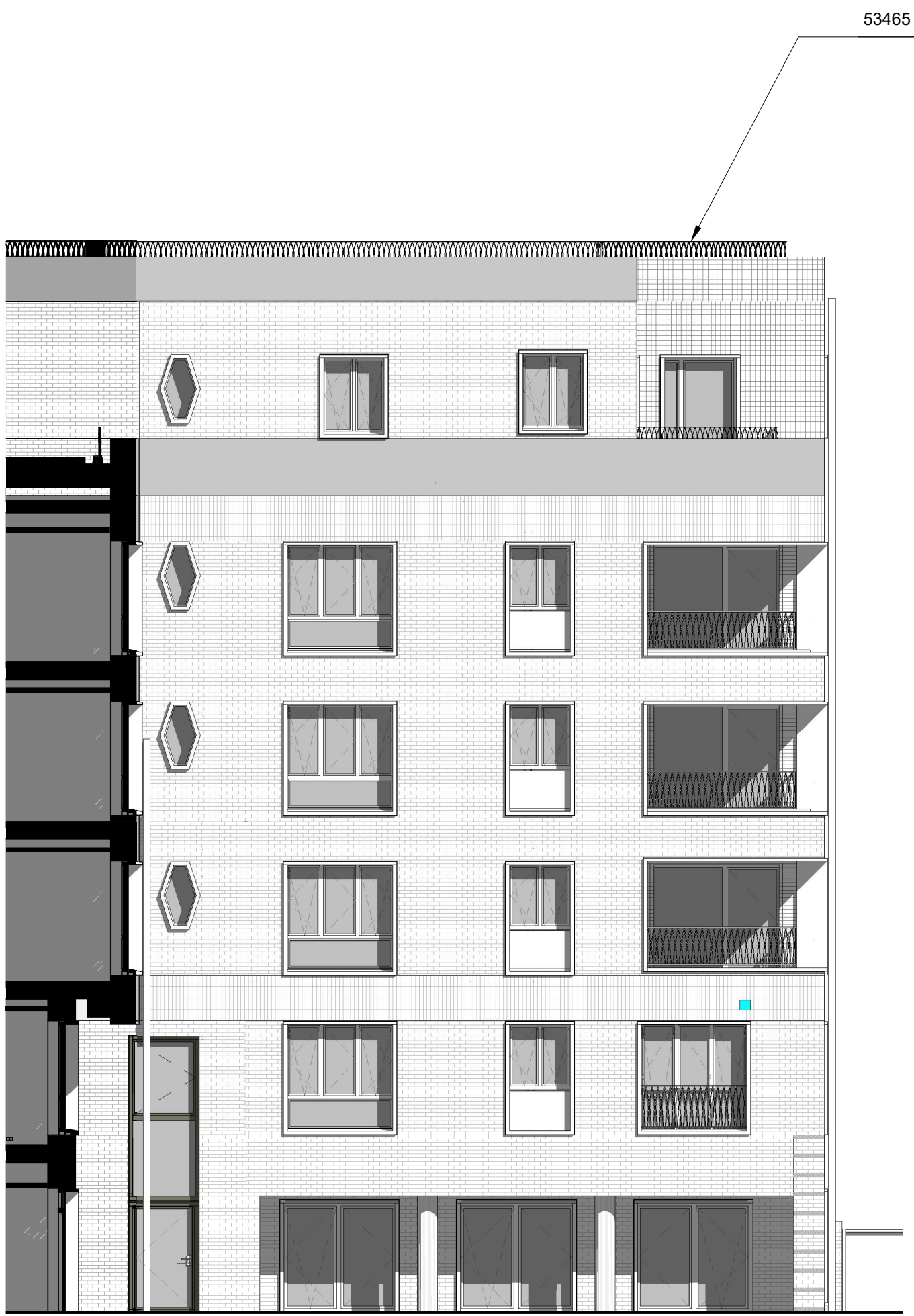
5 West Elevation (Courtyard) - Planning 1 : 100