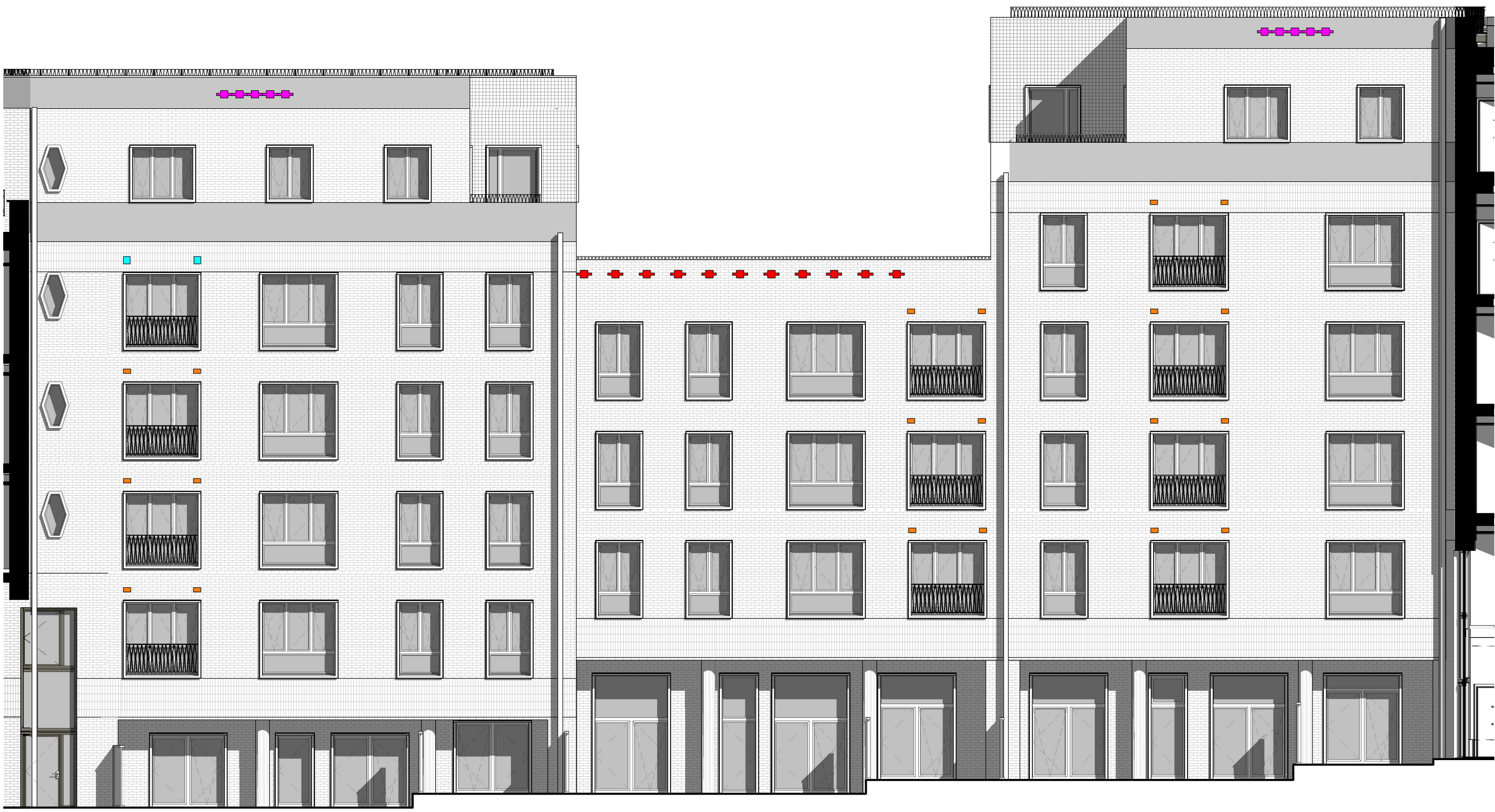
3 East Elevation (Courtyard) - Planning 1 : 100