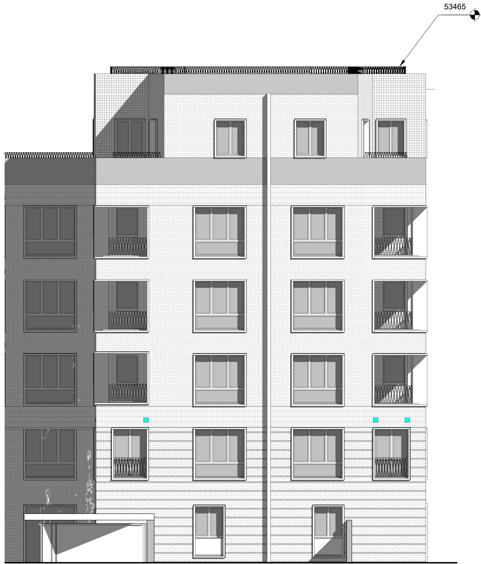
6 South Elevation (Courtyard) - Planning 1 : 100