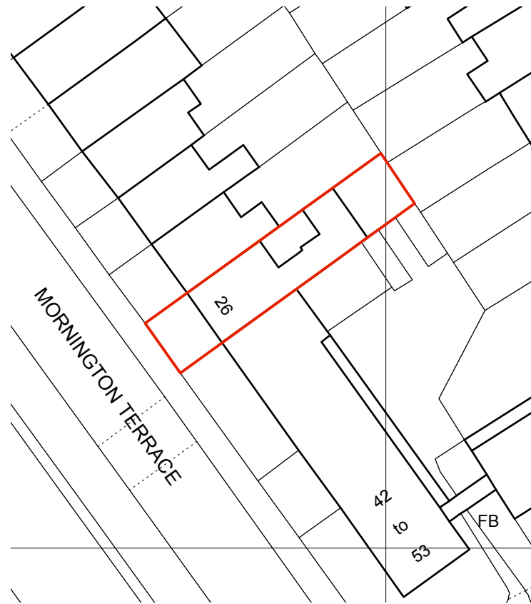
block plan 1:500