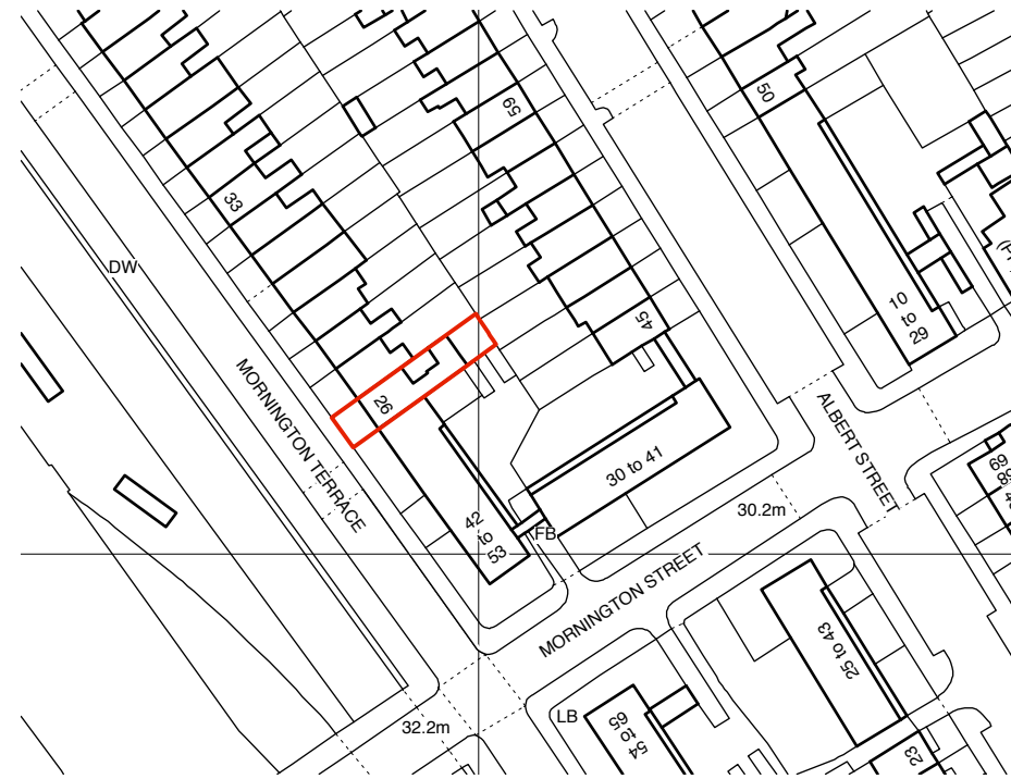
location plan 1:1250