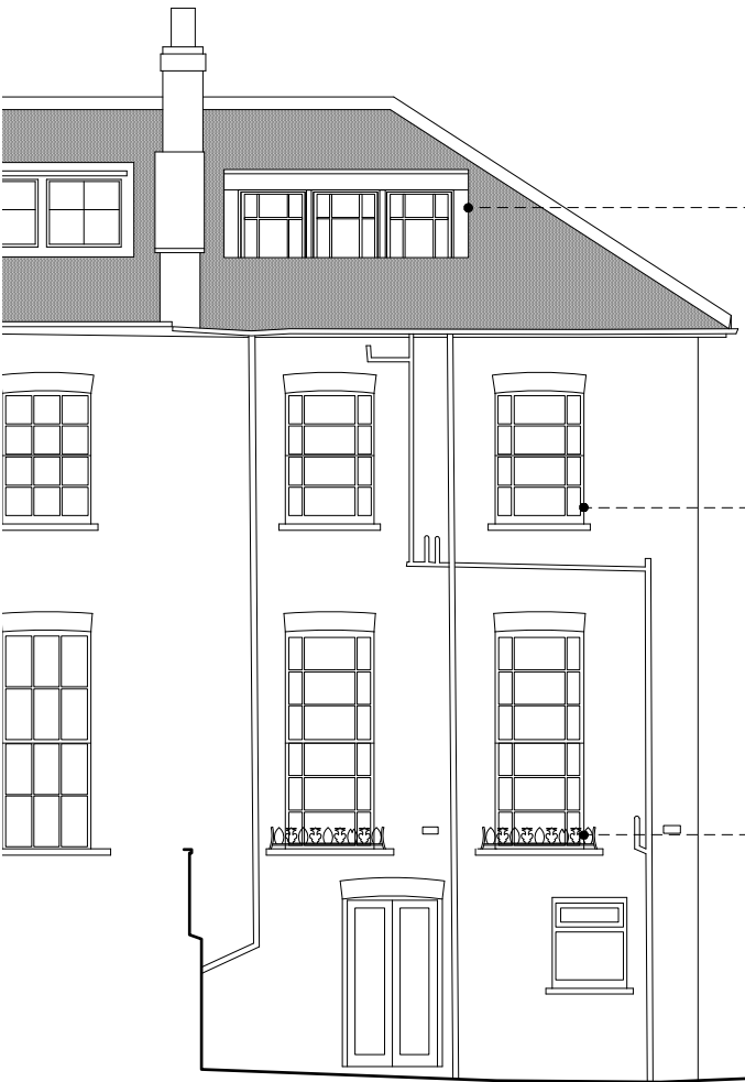
REAR ELEVATION to garden 1:100

Rebuilt dormer clad in lead with new timber framed sash window