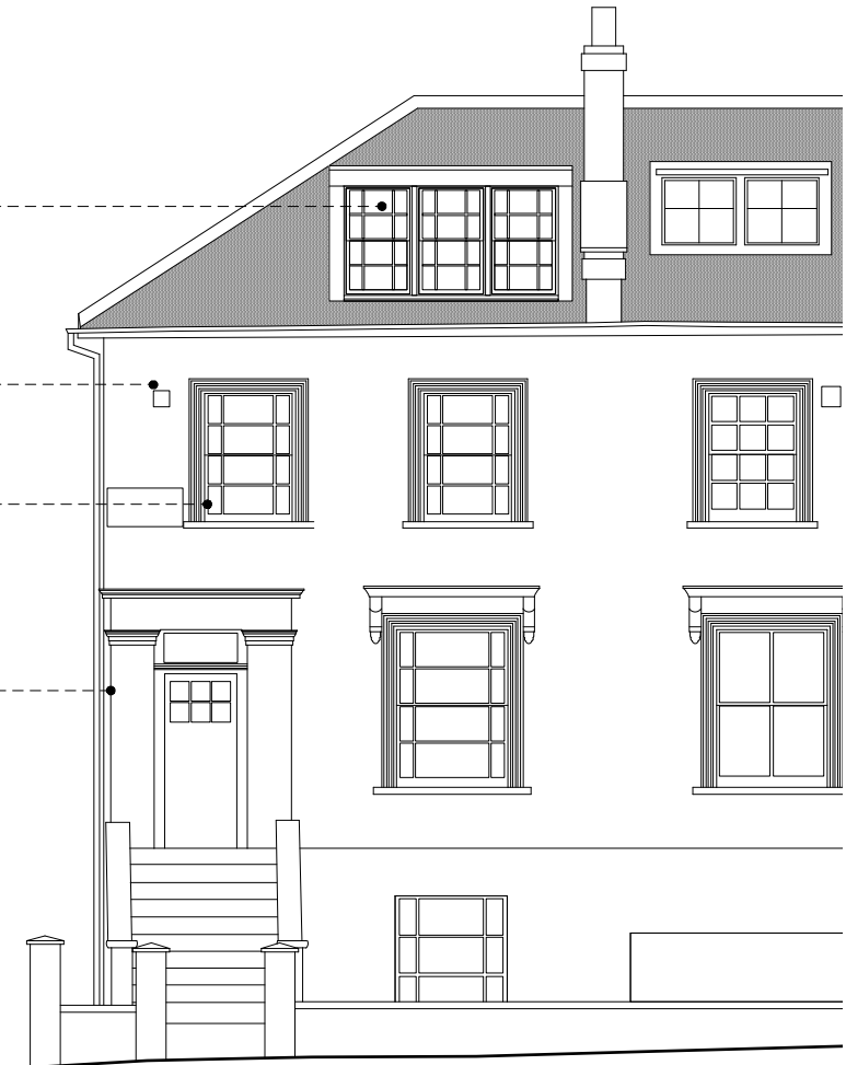
FRONT ELEVATION to Stratford Villas 1:100

Painted stucco door surround repaired and repainted