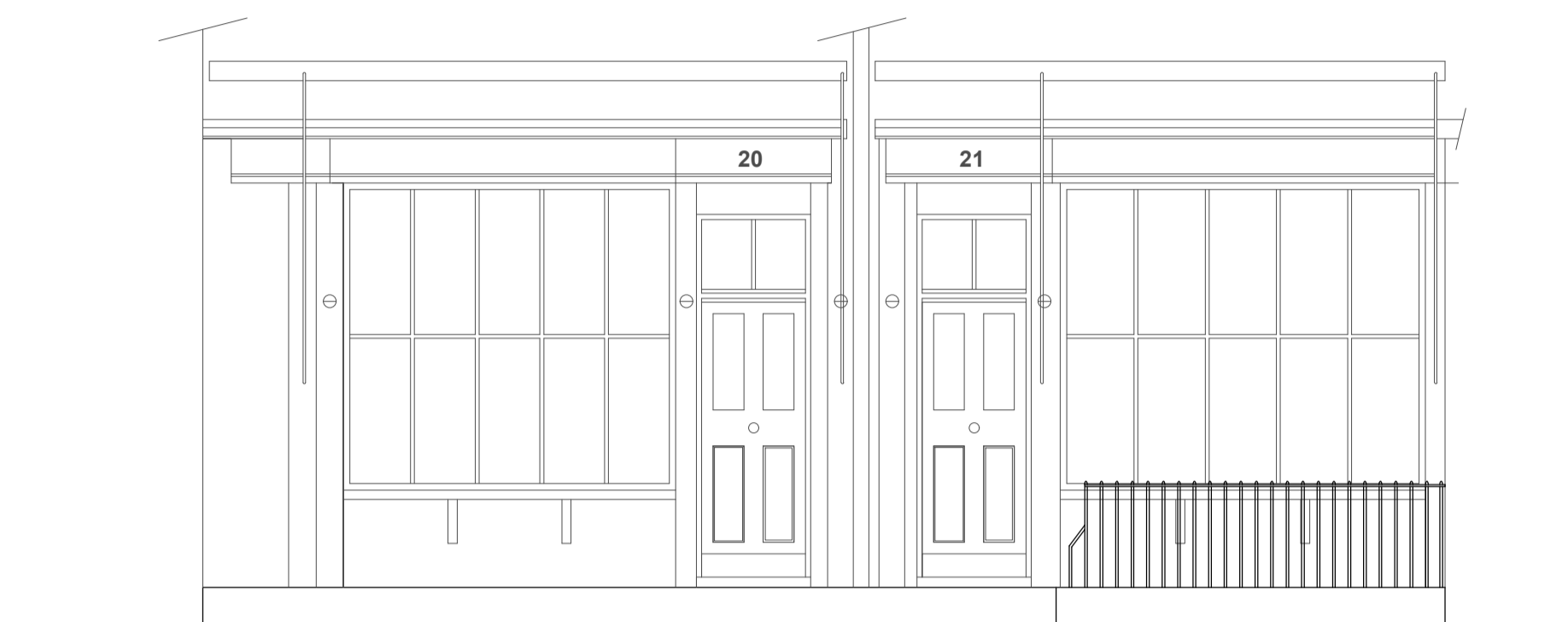
2 Existing Warren Street Elevation