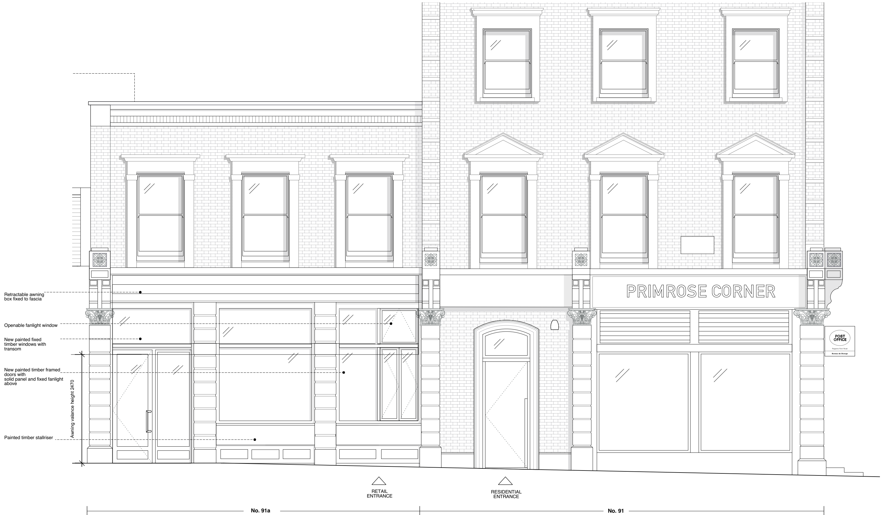
SOUTH WEST SHOPFRONT ELEVATION AS PROPOSED Scale: 1:50 @ A3