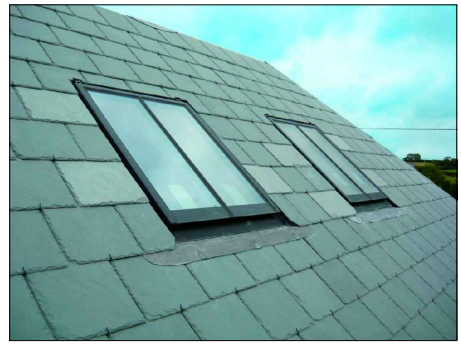
Conservation Rooflight Reference Image