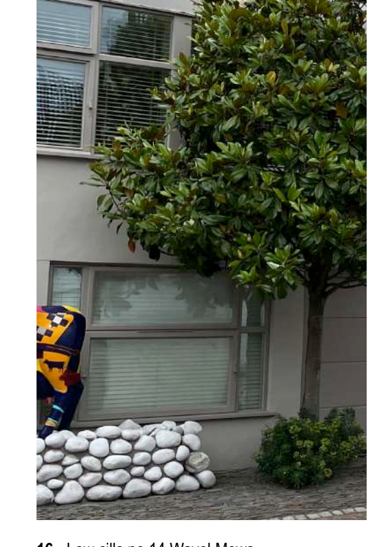
16 - Low cills no.14 Wavel Mews