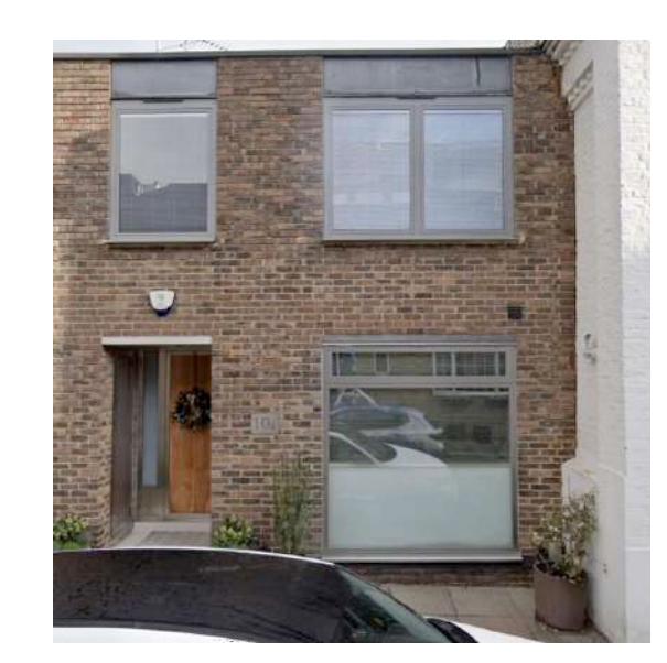
15 - Low cills no.10a Wavel Mews