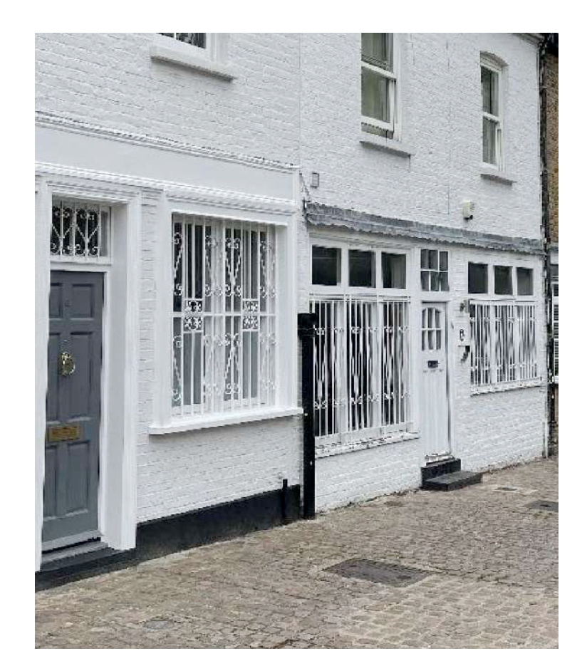
17 - Low cills no. 9 Wavel Mews