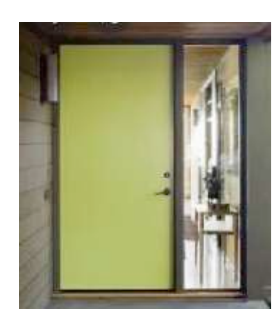
14 - Ref: Main Entrance door Image reference