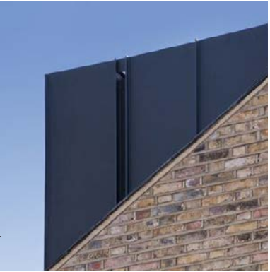
01 Metal dormer, standing seam zinc or aluminium cladding