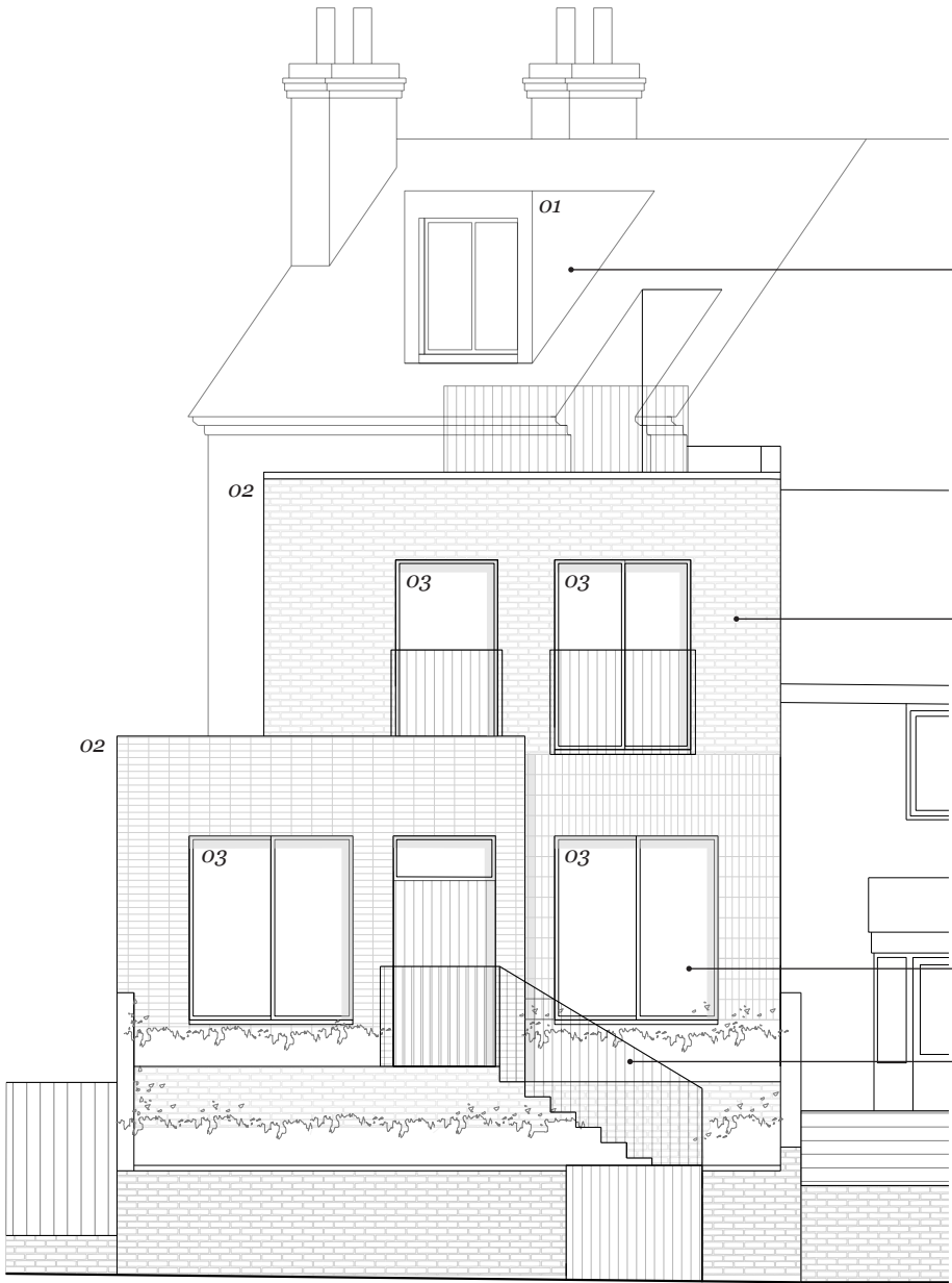
Westbere Road Elevation Not to scale