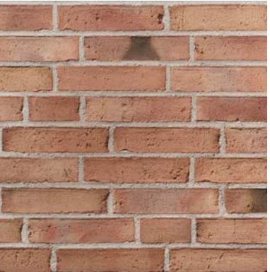
02 Red bricks to Westbere road elevation, with stacked vertical and horizontal brick bonds at ground floor Image to right: Flower Michelin Architects