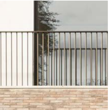
03 New aluminium framed glazing and metal railings, RAL colour tbc Image: Fleet House, Stanton Williams