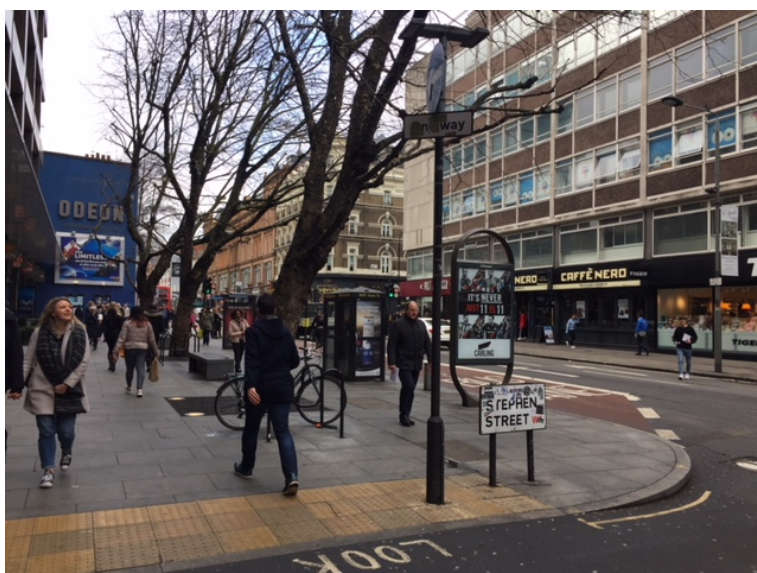
Photo 2 (above): View of existing sign looking north along Tottenham Court Road