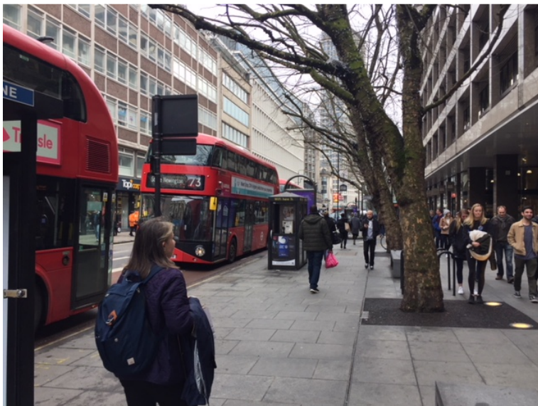
Photo 4 (above): View of proposed location of sign (looking south-east along Tottenham Court Road)