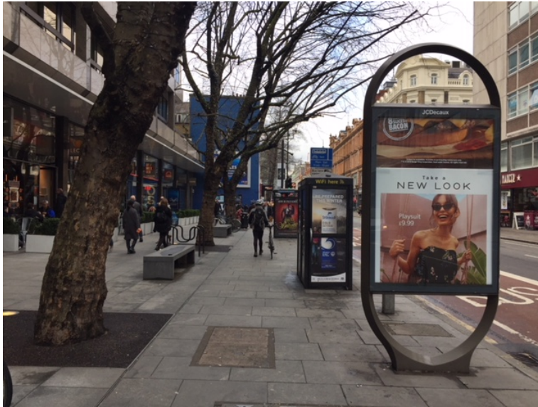
Photo 3 (above): View of existing sign and location of proposed sign to be situated in street furniture zone on pavement between two existing telephone kiosks (looking north-west along Tottenham Court Road)