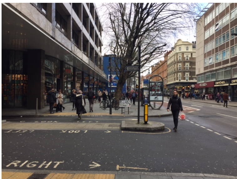
Photo 1 (above): View of existing sign adjacent to junction with Stephen Street (looking north-west along Tottenham Court Road)