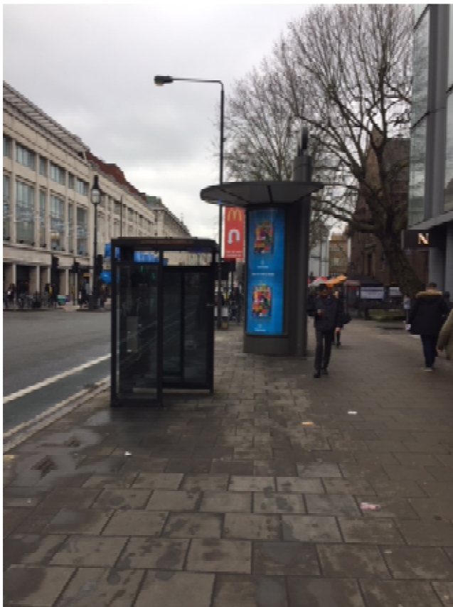
Photo 2 (above): View of existing sign looking south-east along Tottenham Court Road