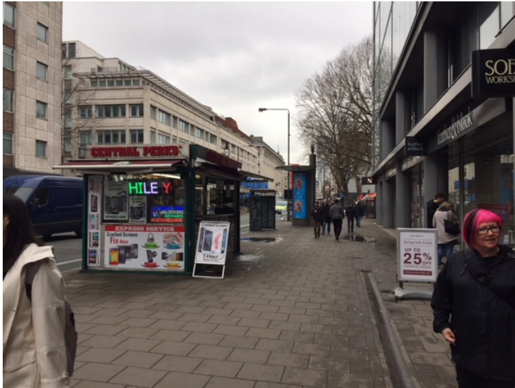
Photo 1 (above): View of existing sign and location of proposed sign to be situated in street furniture zone on pavement between existing coffee kiosk and telephone kiosk (looking south-east along Tottenham Court Road)