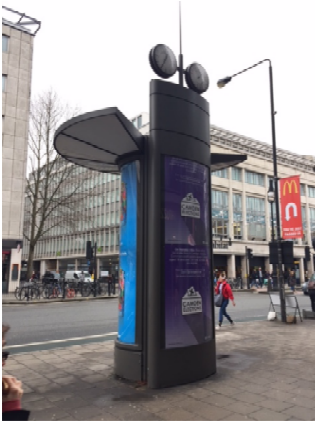
Photo 3 (above): Close-up view of existing sign looking east towards Torrington Place