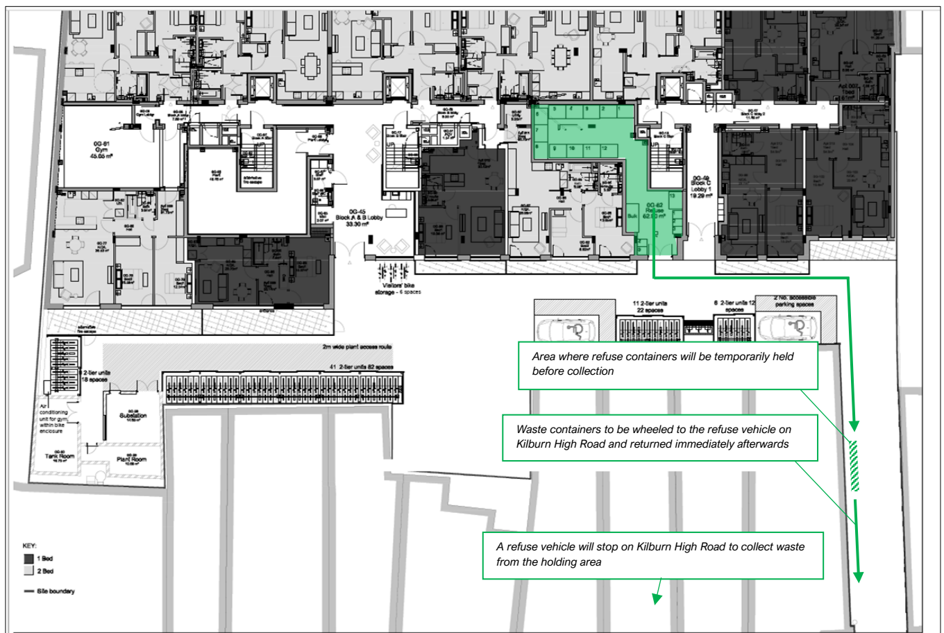
Figure 4.2: External Waste Transfer Route