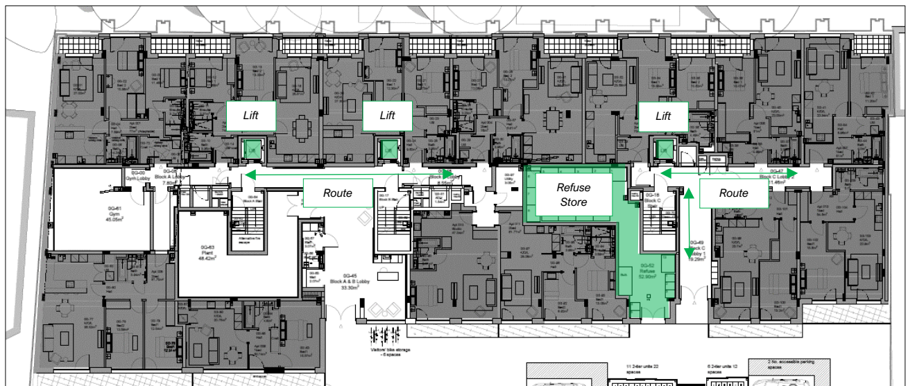
Figure 3.1: Internal Transfer Routes