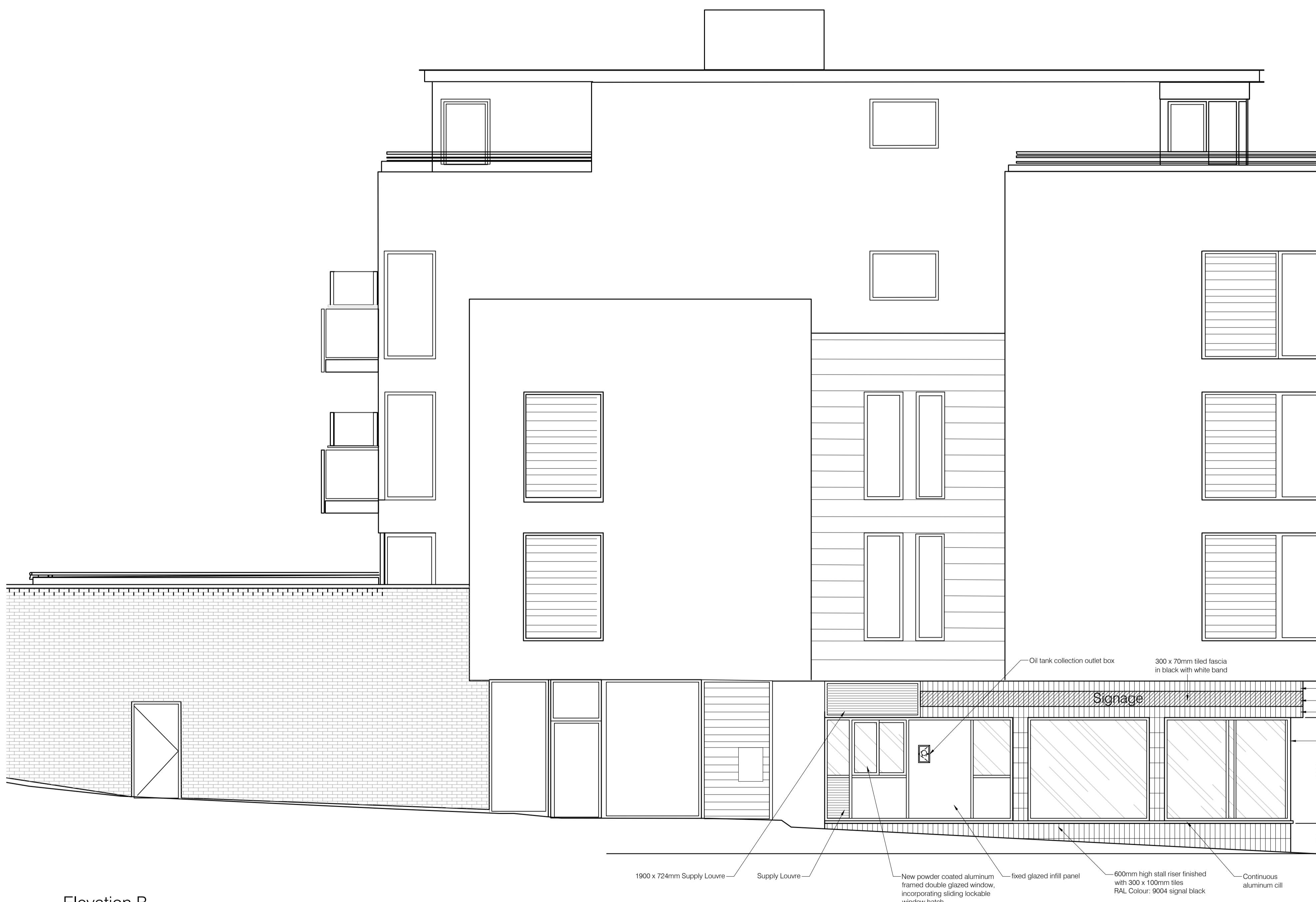
Elevation B Proposed Side Scale 1:50