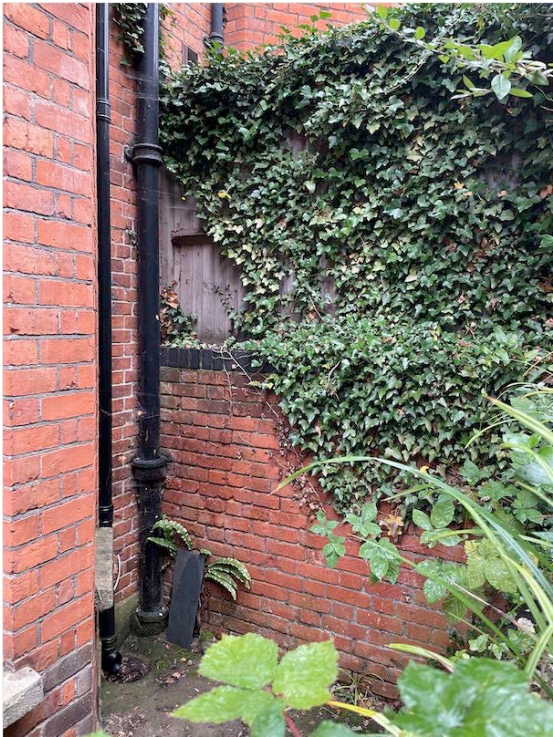
3. BOUNDARY CONDITION REAR GARDENS BETWEEN No.15 & 17 CLOSE BOARDED FENCE ABOVE BRICK WALL