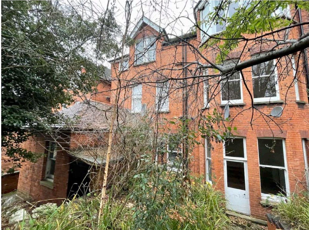
5. VIEW OF REAR OF No.17