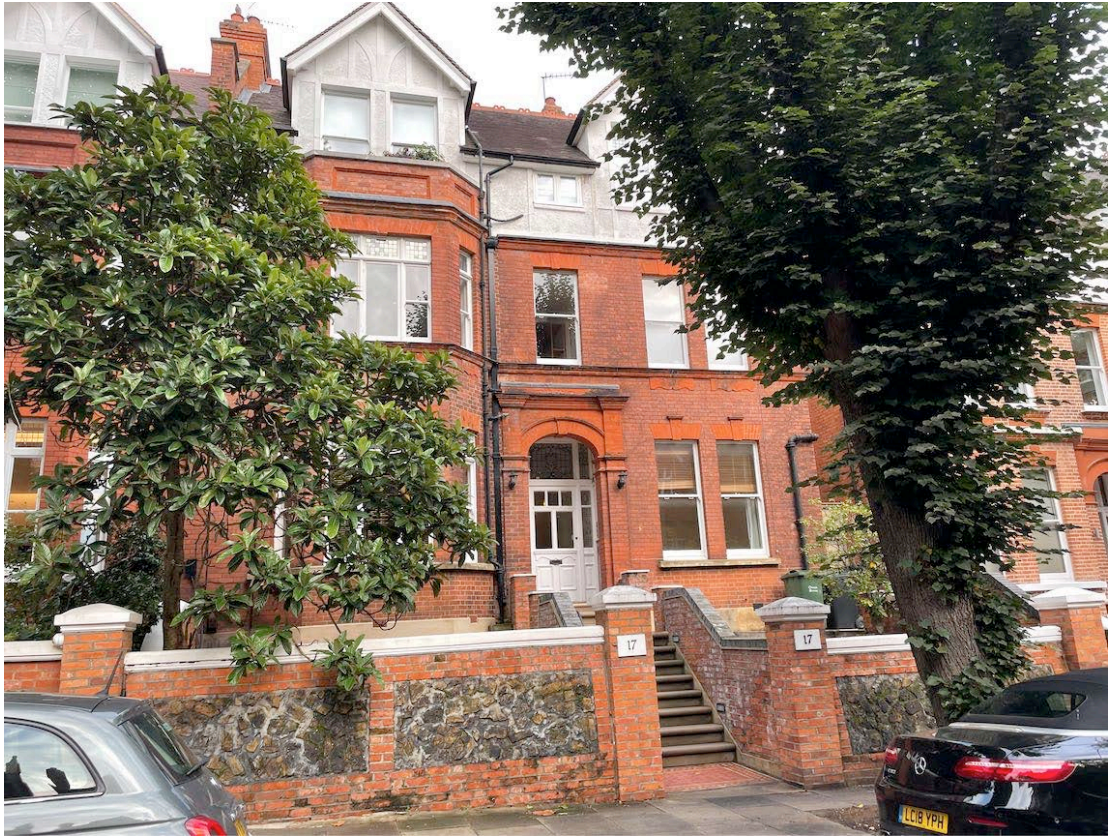
1. VIEW OF NO.17 FROM THE STREET