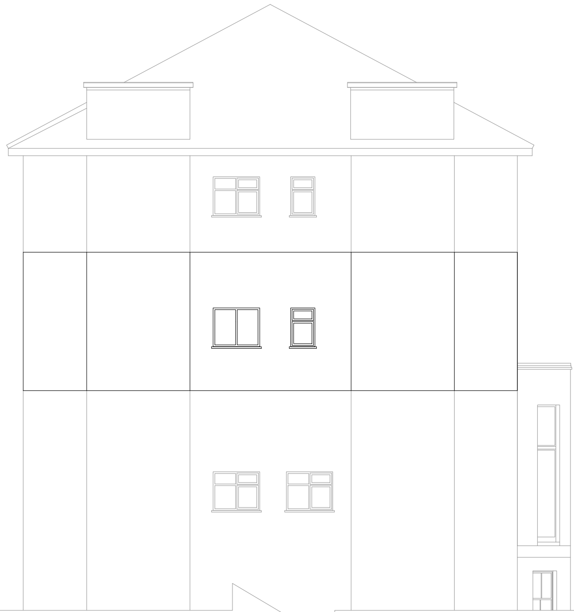
SIDE ELEVATION AS EXISTING