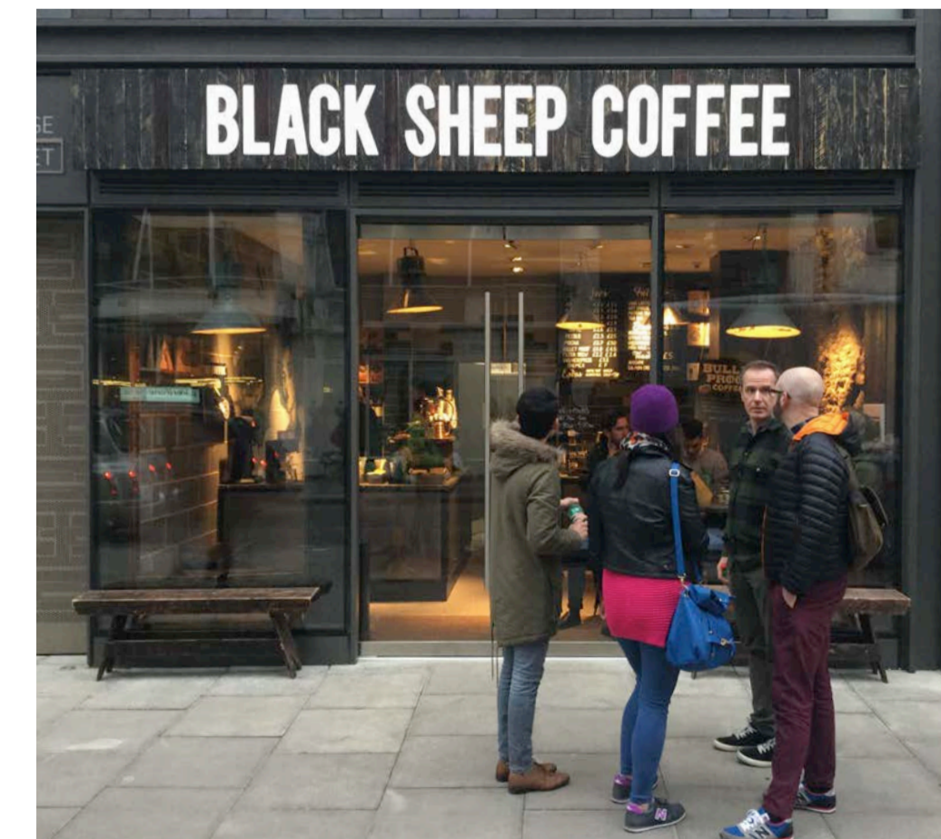
4 PHOTOGRAPH - REFERENCE IMAGE - FASCIA PANEL NOT TO SCALE