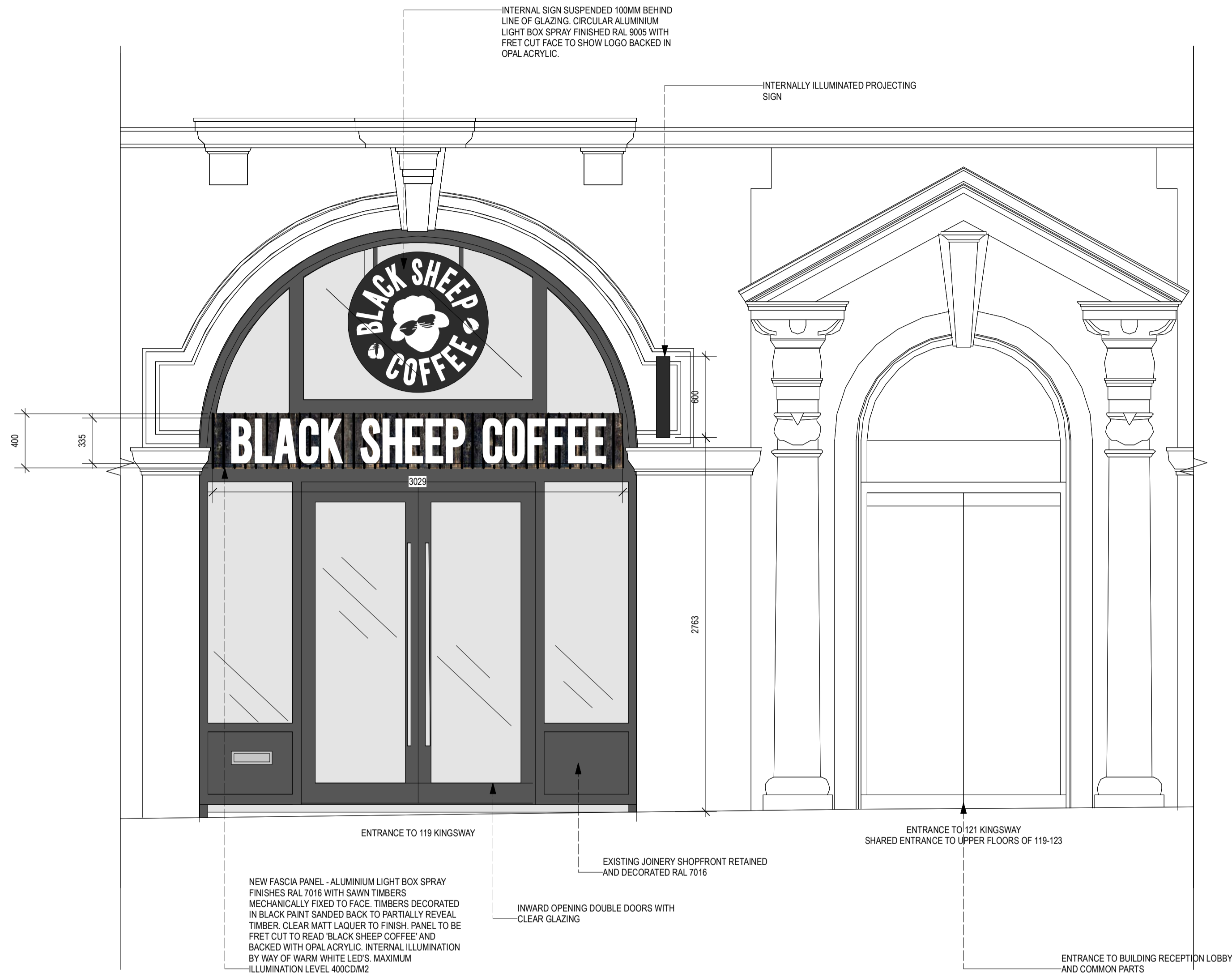
1 PROPOSED SHOPFRONT SCALE 1:25 @ A1