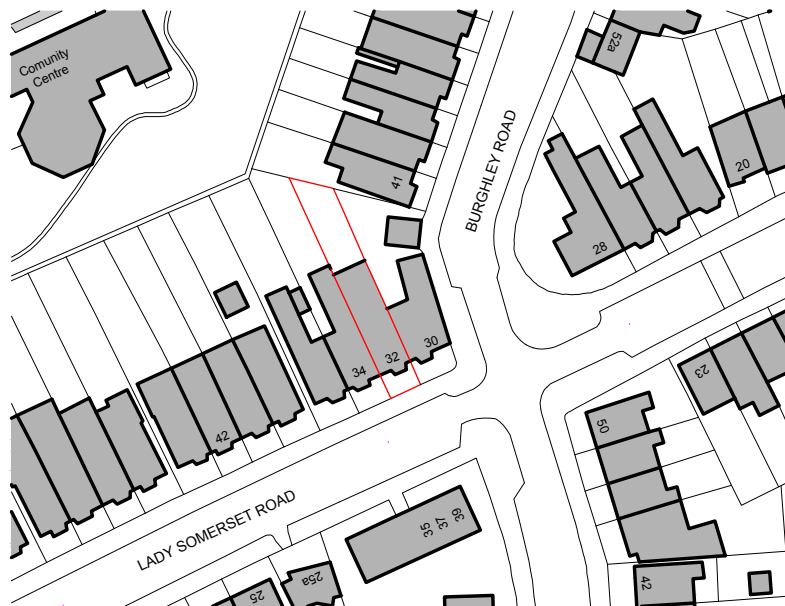
01 LOCATION PLAN