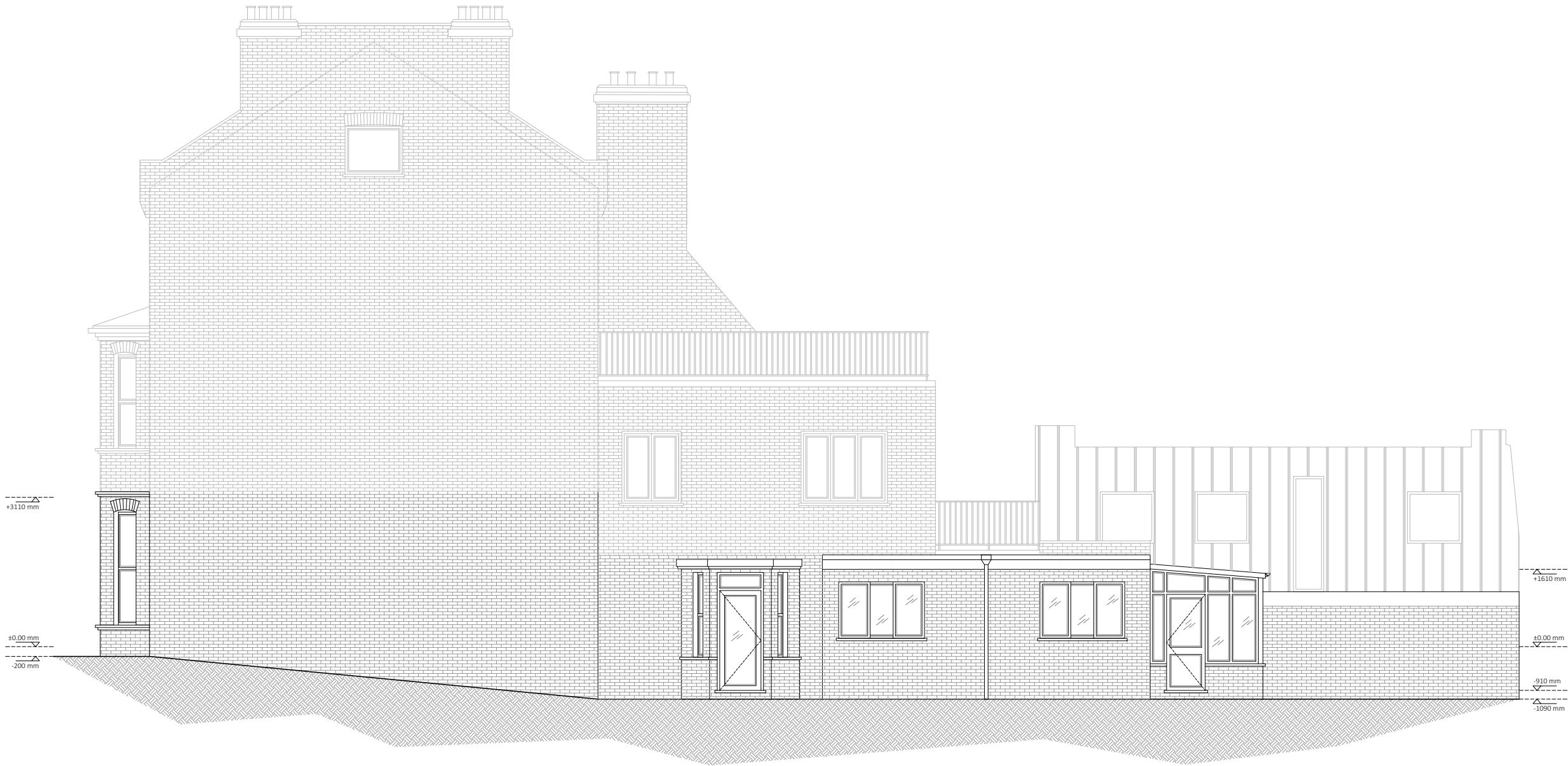
EXISTING WEST SIDE ELEVATION