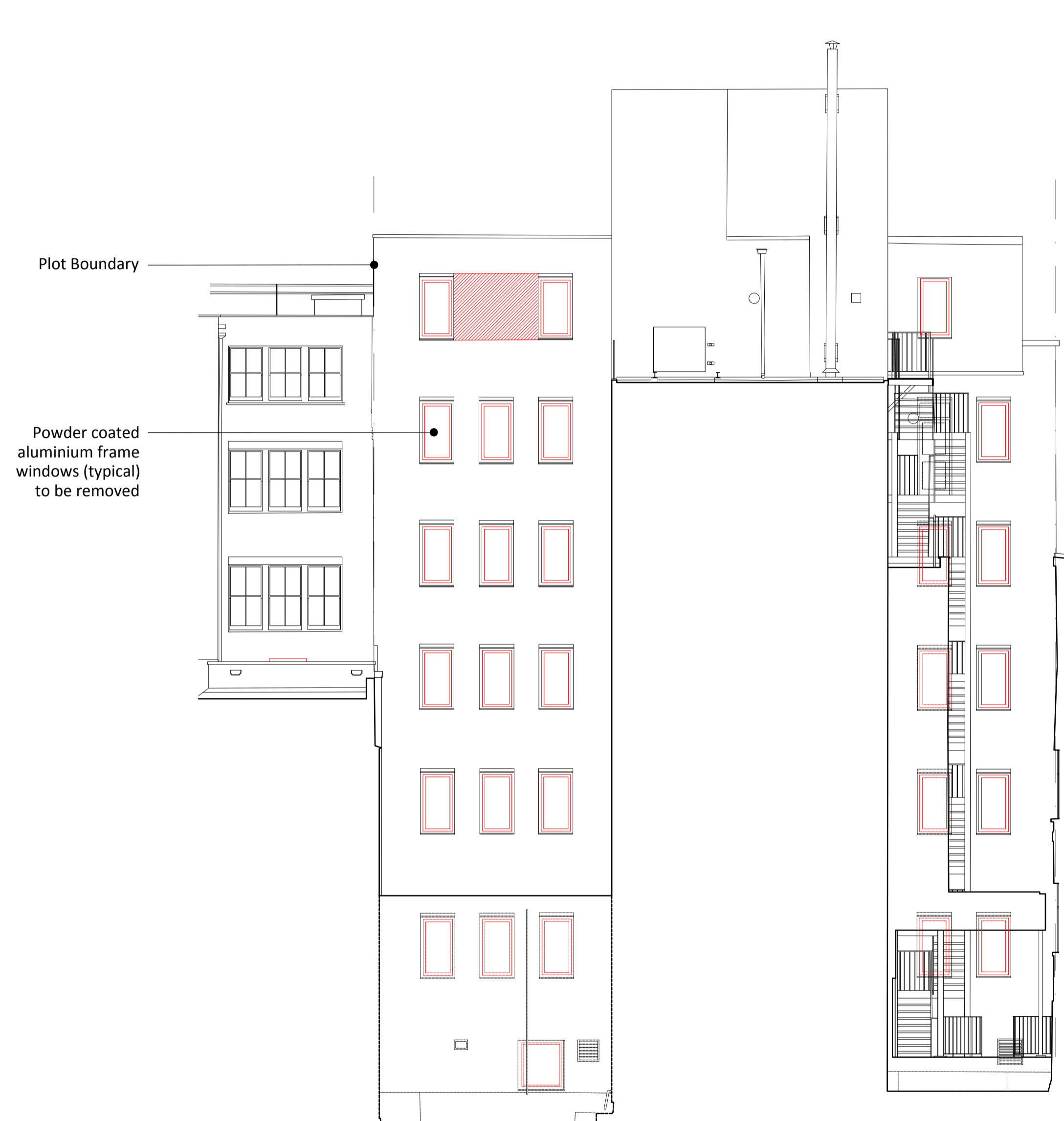
01 EAST ELEVATION