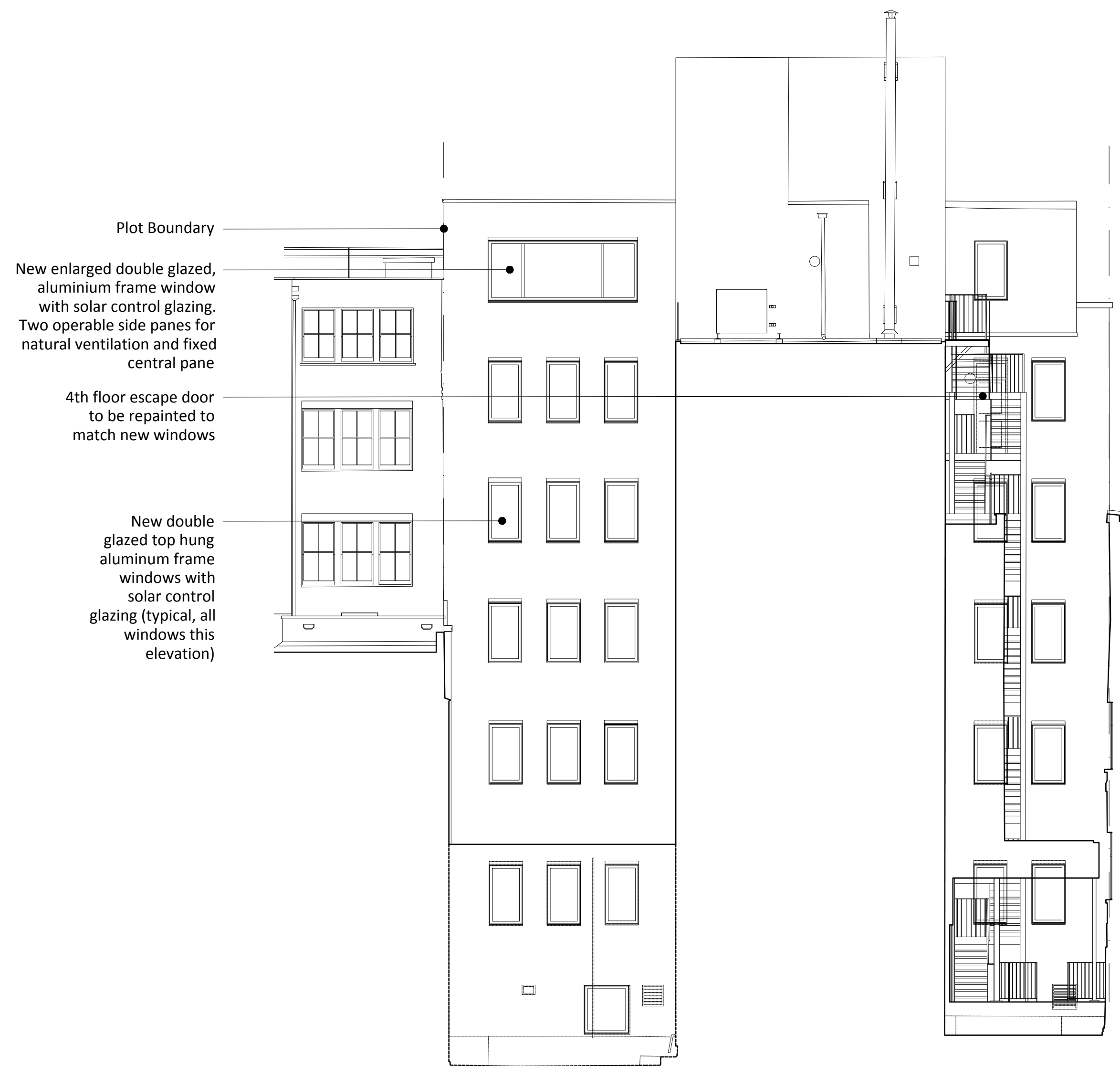
01 EAST ELEVATION