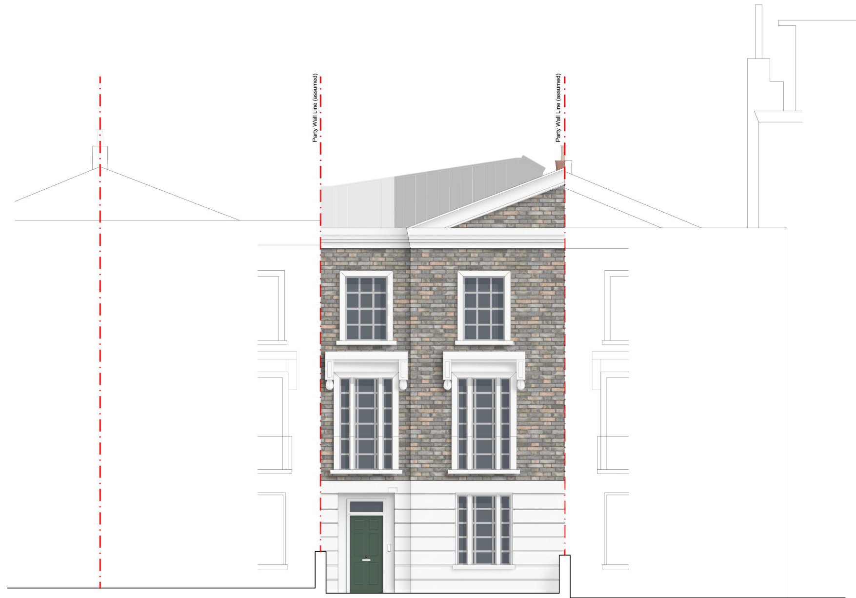
Proposed West Elevation 1:100@A3