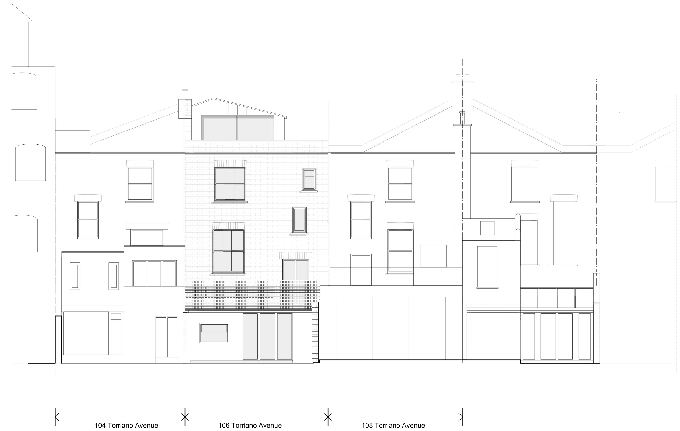
Existing East Elevation 1:100@A3