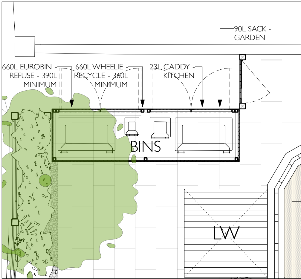
ELSWORTHY ROAD WASTE STORAGE