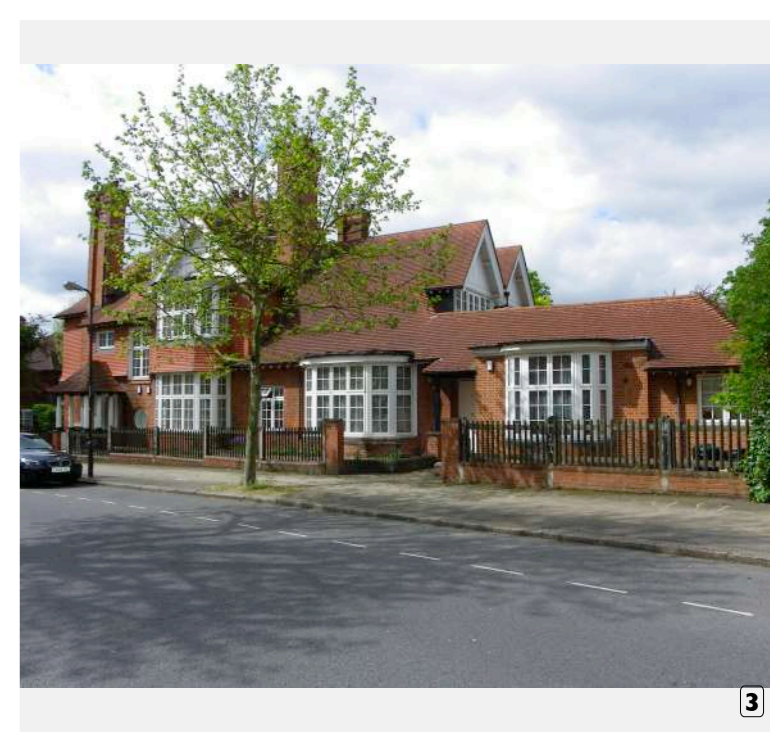
EAST-MAIN FACADE - WADHAM GARDENS