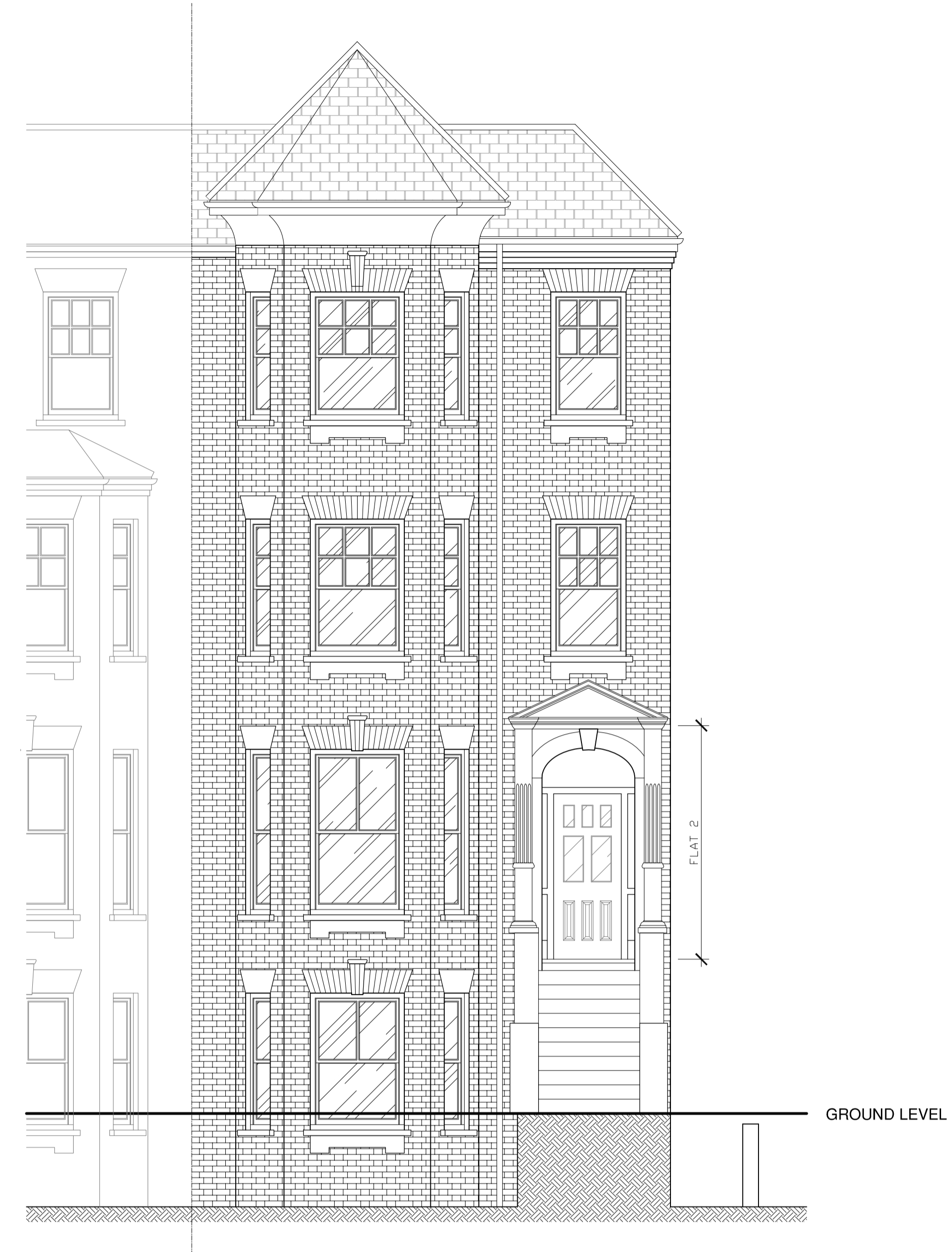
02 FRONT ELEVATION 01 SCALE 1:50