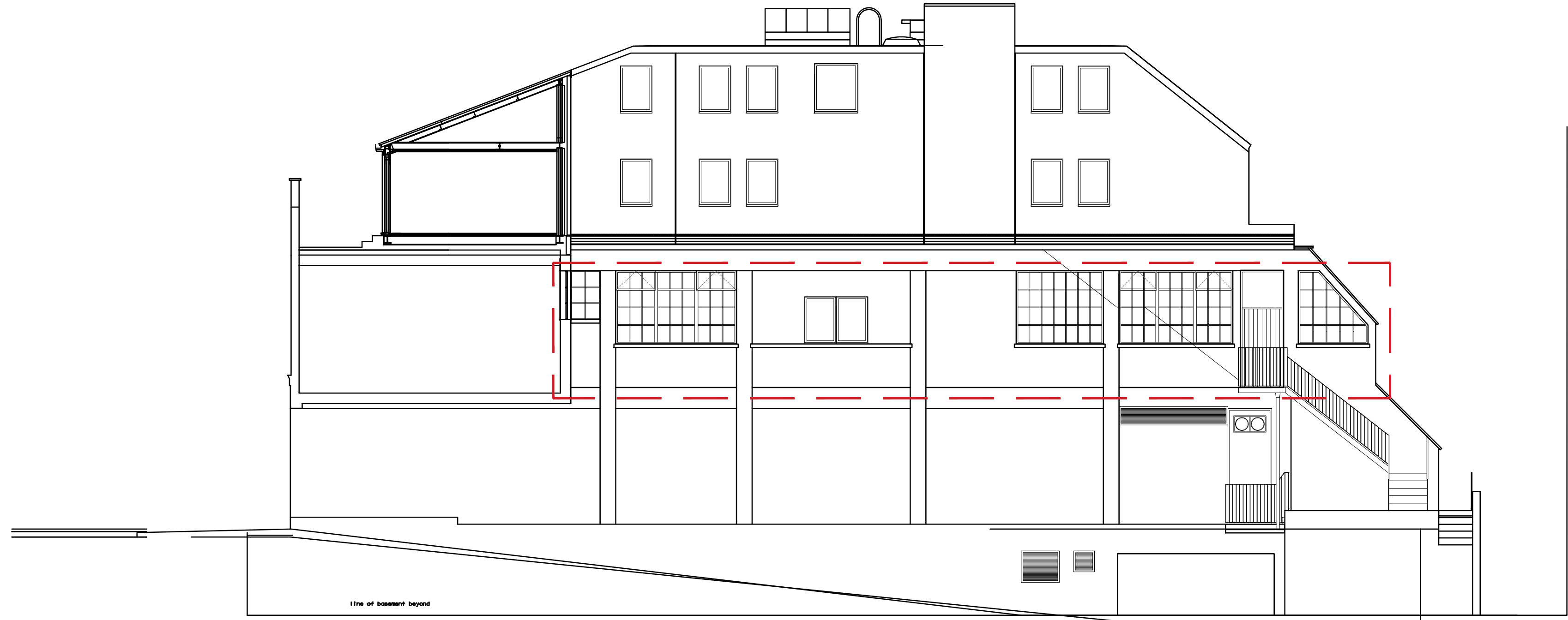
Proposed South East Elevation C 1:100