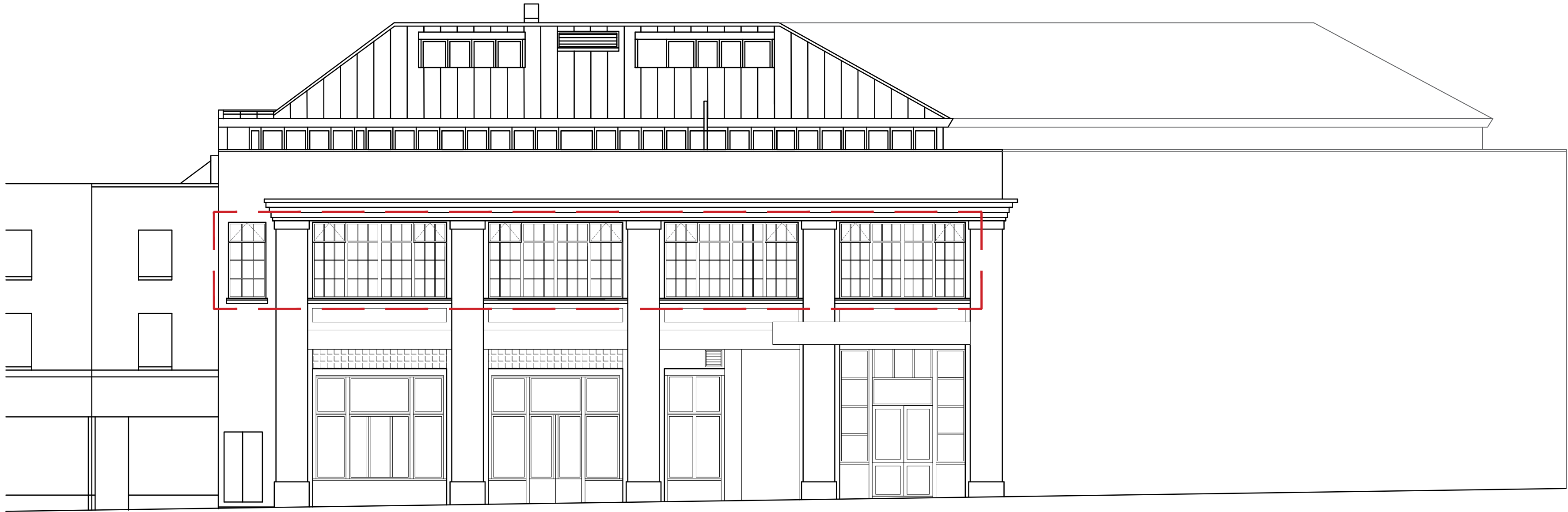
Proposed Parkway Elevation A 1:100