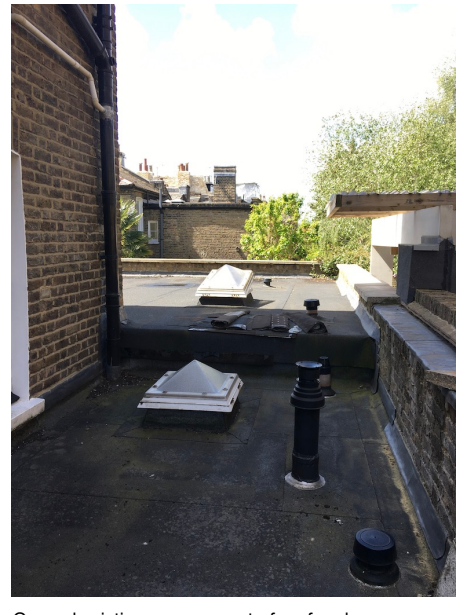
General existing arrangement of roof and neighbour's roof structures around rear elevation area