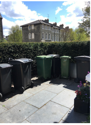
Refuse area in need of organisation