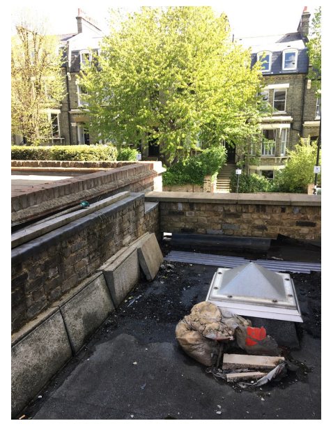
General existing arrangement of roof and neighbour's roof structures to front elevation

Lucy Read Architects 13 Retcar Place N19 5TT lucyread@icloud.com 07779 789 268