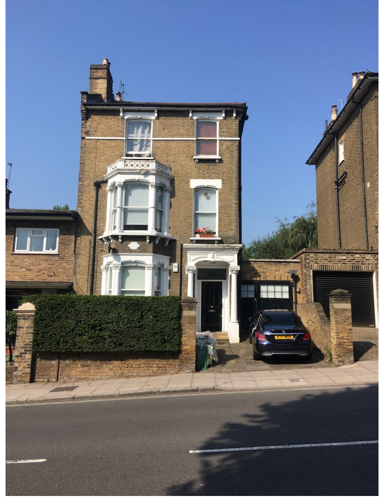
Elevation from Dartmouth Park Hill - Front Elevation

Lucy Read Architects 13 Retcar Place N19 5TT lucyread@icloud.com 07779 789 268