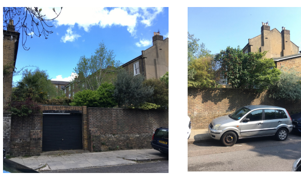
Views across 21 Dartmouth Park Hill, from Spencer Rise Flat 1, Dartmouth Park Hill NW5 1HP Existing Site Photographs – Street Elevations and Refuse Area 1 of 3 sheets