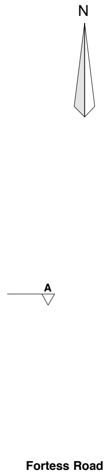
Existing Second Floor Plan Scale 1:100