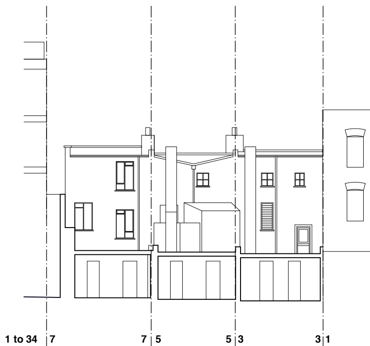
Existing Rear Sectional Elevation B Scale 1:100

ONLY STATUS 'C' DRAWINGS TO BE USED FOR CONSTRUCTION PURPOSES