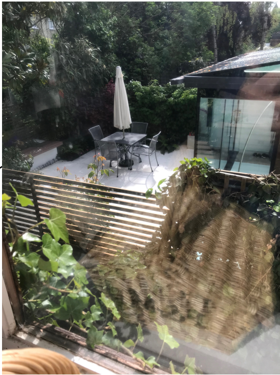
View out of existing conservatory