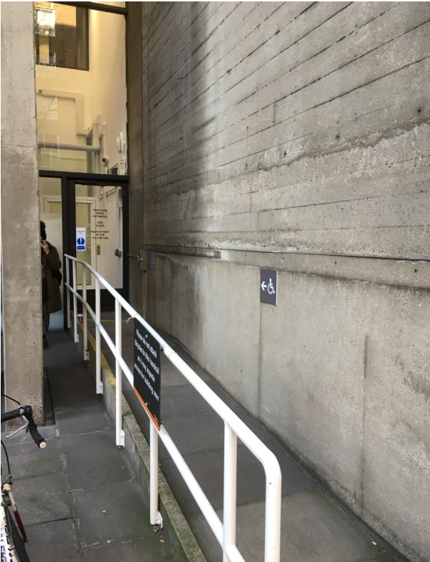
Photograph of external ramp and door to existing platform lift

This secondary access route, is not inclusive and requires wheelchair users to experience their arrival in a very different way.