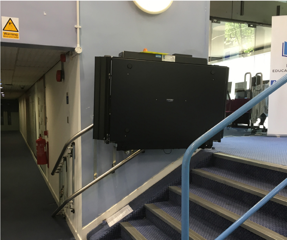
Photograph of existing folding stair lift

On entering the building at level 3 the current platform stair lift is fairly dominant in the view through the building. At weekends this entrance is the only entrance available for external visitors and needs to provide suitable independent access for all.