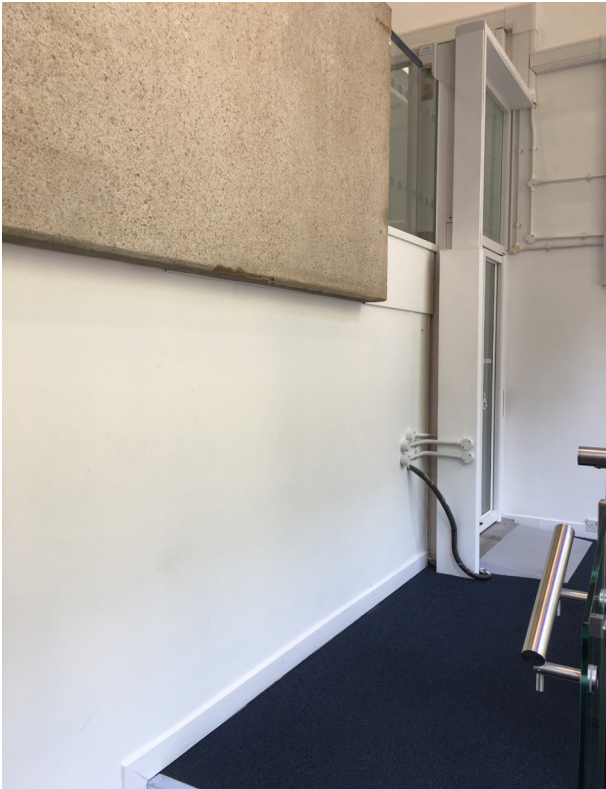
Photograph of existing platform lift