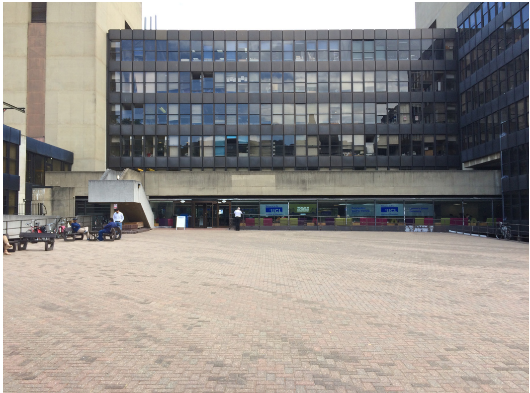
Photograph of terrace to Thornhaugh Mews entrance

A secondary entrance leads pedestrians from the terrace from Thornhaugh Mews, to level 4. The original entrance was through a pair of revolving doors. This was changed to a single revolving door and automatic opening pass door to provide an accessible entrance.