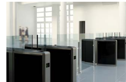
3 TURNSTYLES IMAGE

IMAGE FOR ILLUSTRATIVE PURPOSE ONLY. TURNSTYLES TO BE PPC COATED DARK BROWN TO MATCH EXISTING CURTAIN WALLING.