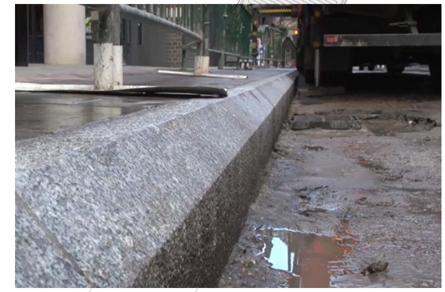
Precedent Image Of Bespoke Chamfered Granite Kerb Not To Scale