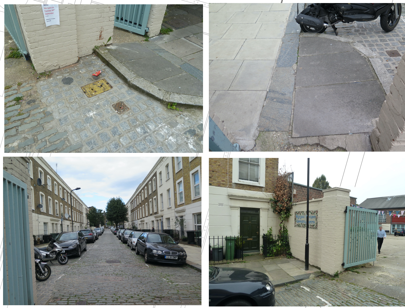
Images Of Existing Granite Sets And Granite Kerb On Bertram Street Not To Scale