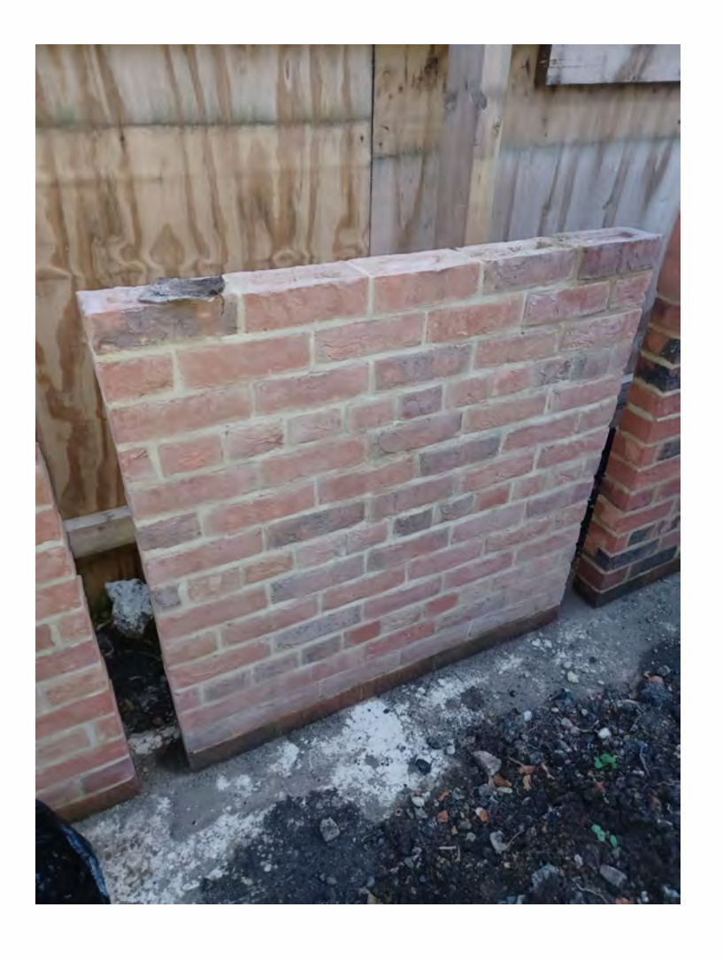
Colorado Red Brick