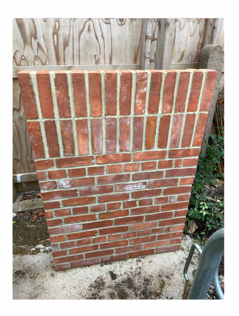
Birtley Olde English - English Garden Bond Sample panel