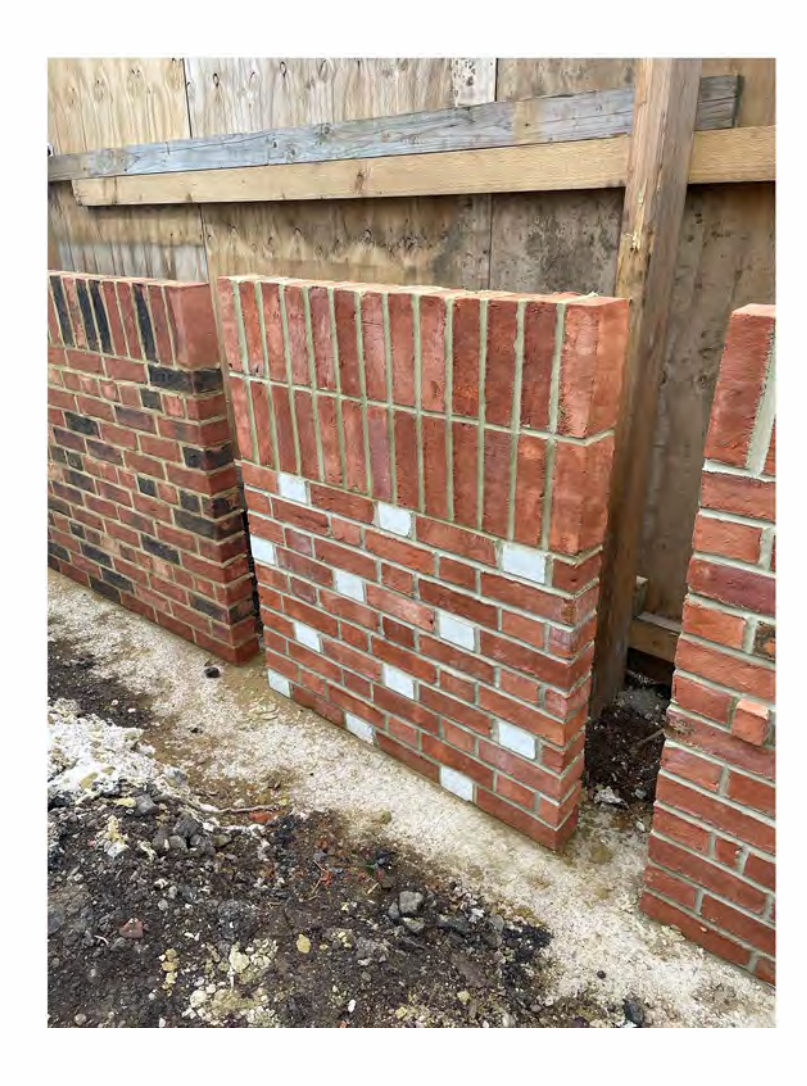
Forticrete White Headers in Birtley Olde English - Flemish Bond Sasmple Panel