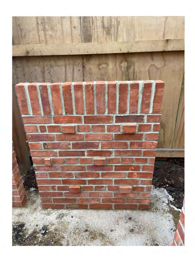
Birtley Olde English with Pulled Headers