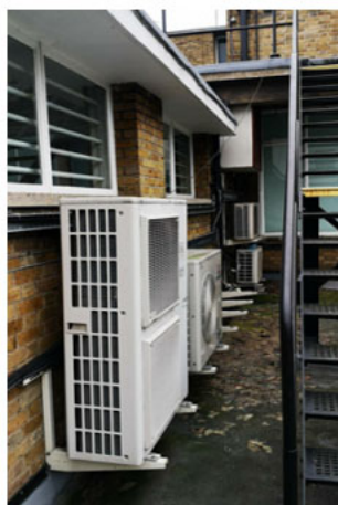
Units 8 & 9 2no. existing decommissioned condenser units on first floor wall to be removed