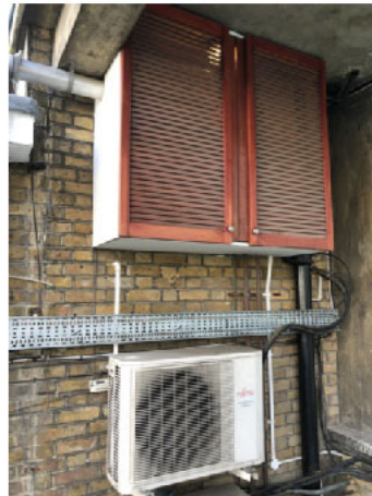
Unit 5 & Gas Boiler existing condenser unit and gas boiler to be removed