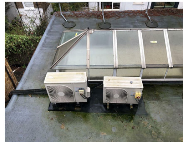
Units 6 & 7 2no. existing condenser units on first floor roof to be removed