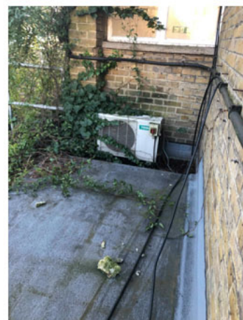
Unit 10 - Existing condenser unit on first floor roof to be removed