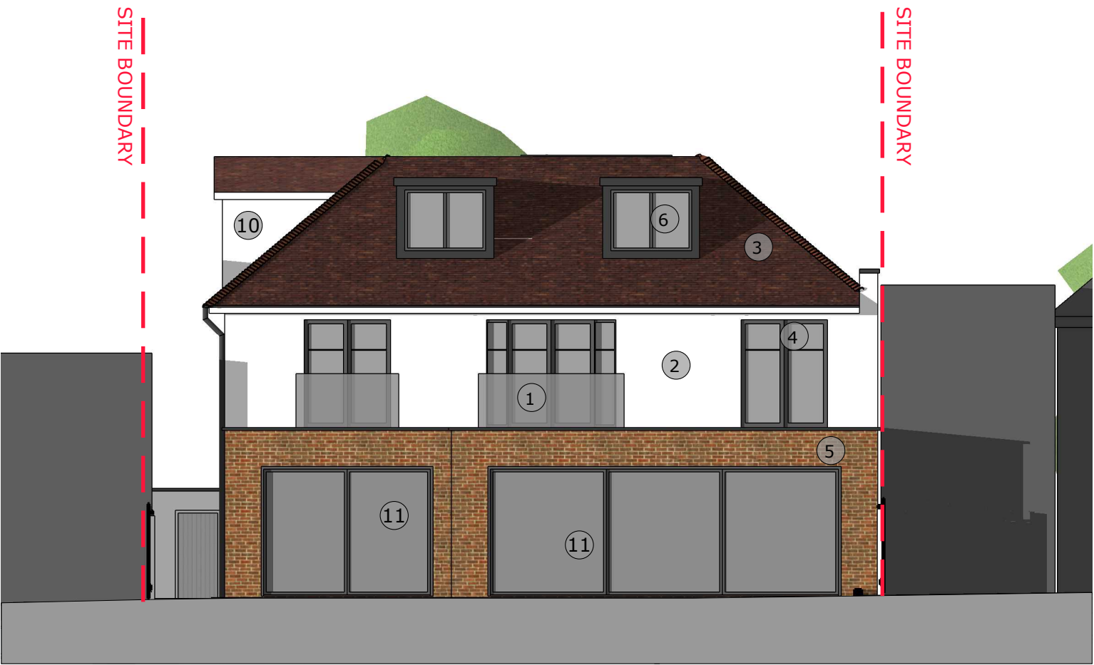
[01] PROPOSED REAR ELEVATION (north east)