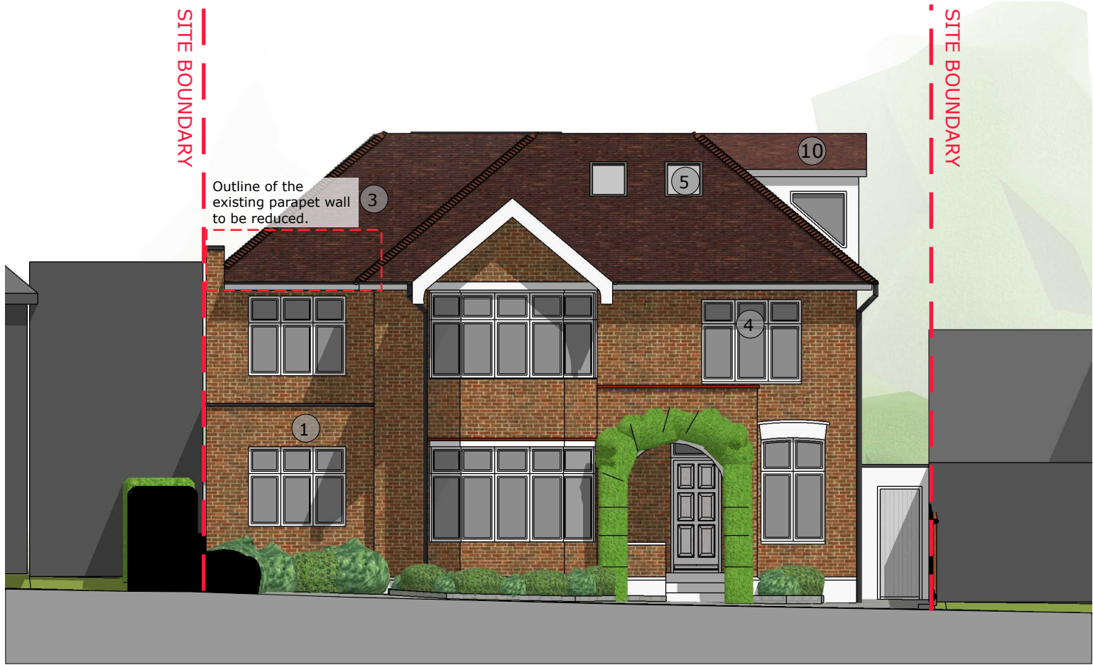
[01] PROPOSED FRONT ELEVATION (south west)