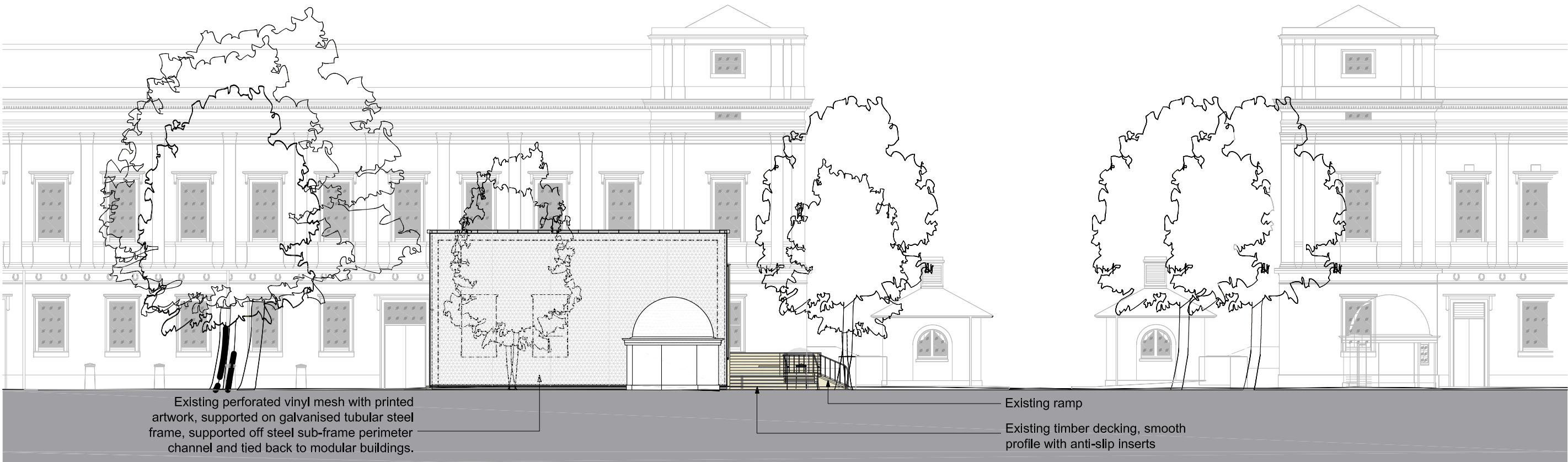
01 Proposed South West Elevation