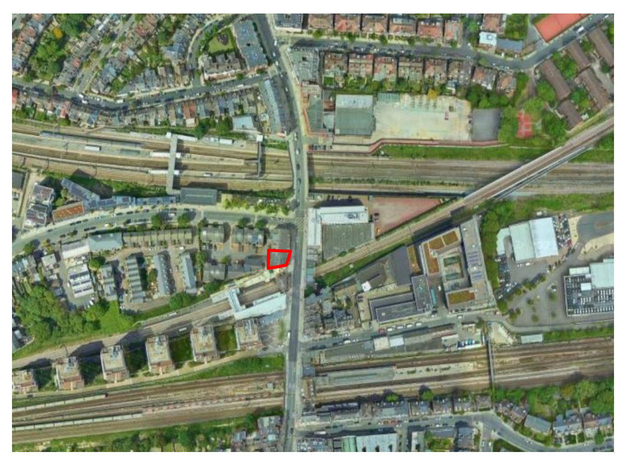
Figure 1. Aerial view of the Site (identified in red) and surrounding area.