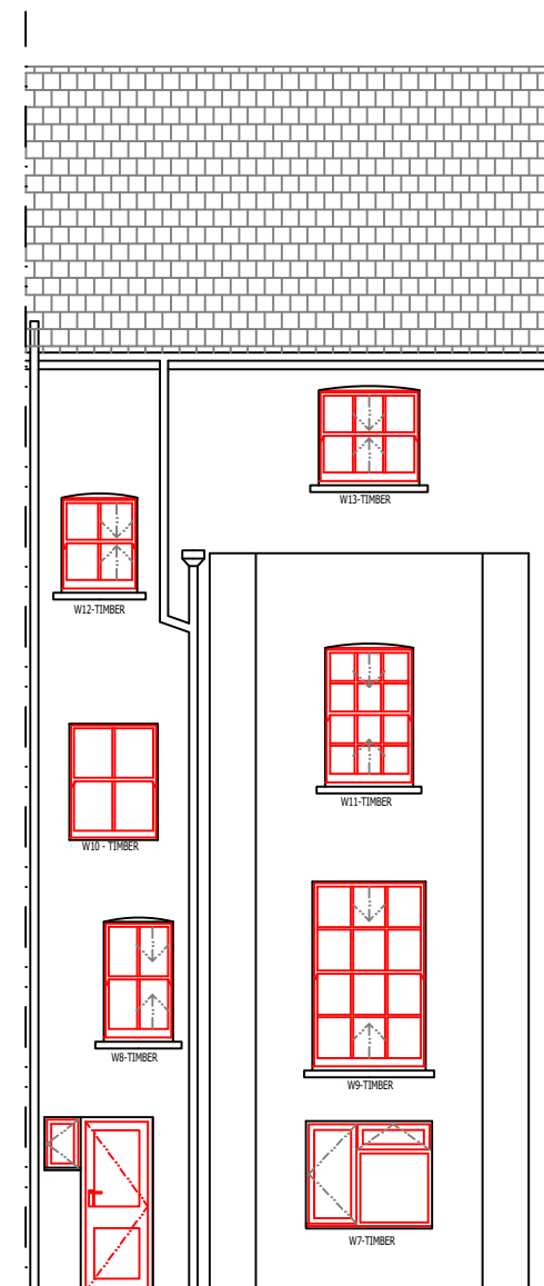
85 AGAR GROVE PROPOSED REAR ELEVATION VIEW B - 1:100