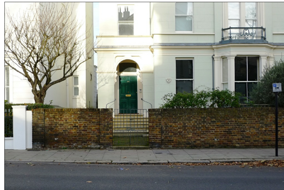
general view of existing boundary wall-1