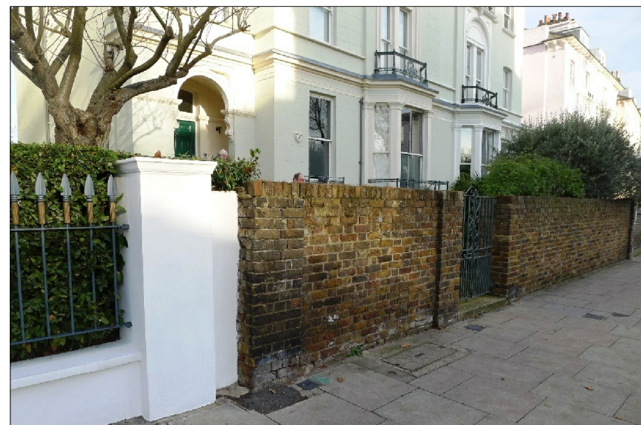
general view of existing boundary wall-2