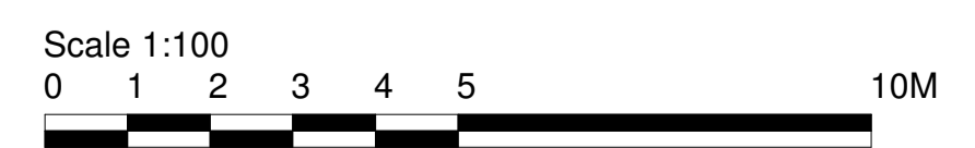
1 1 EXISTING - GROUND FLOOR PLAN 07130 01110 1:100

H:\2021\06\01\Documents\SAH-AUK-ZZ-00-DR-A-07130-01110.dwg