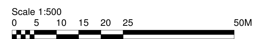
I 07001 SITE LOCATION PLAN 1 : 500

H:\2021\06\03\Documents\SAH-AUK-ZZ-ZZ-DR-A-07001_060321.dwg