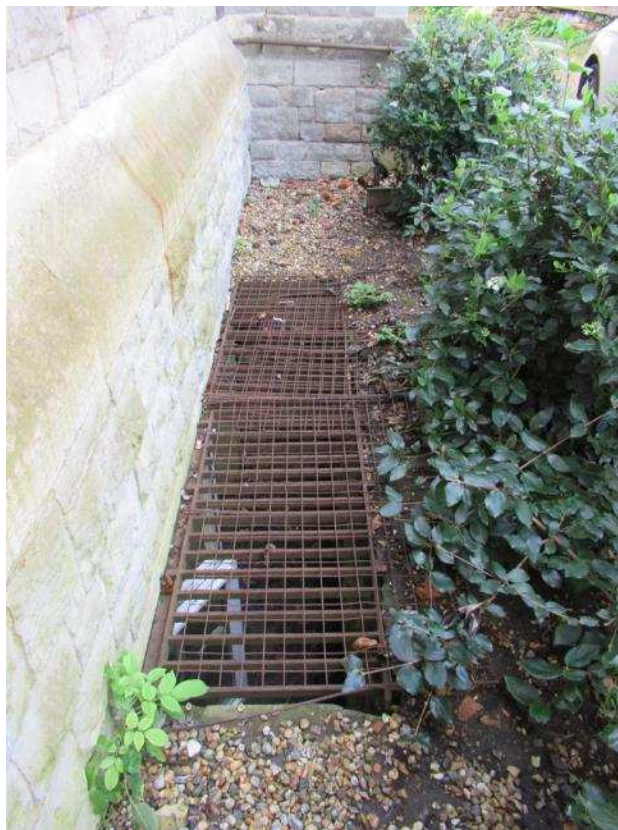
Photoplate 5 – View of External Lightwell Grille