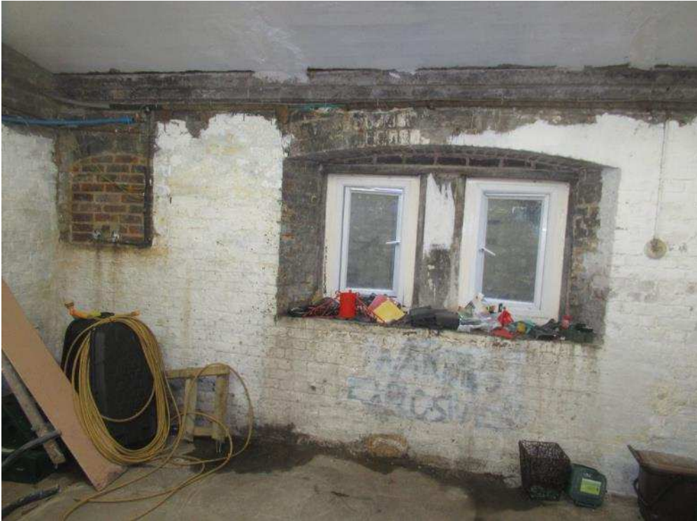
Photoplate 2 – View of Windows to Lightwell from within Crypt Plant Room