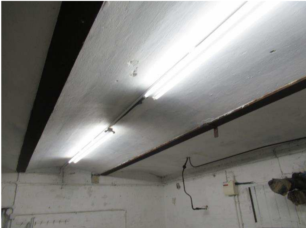
Photoplate 4 – View of Crypt Plant Room Soffit