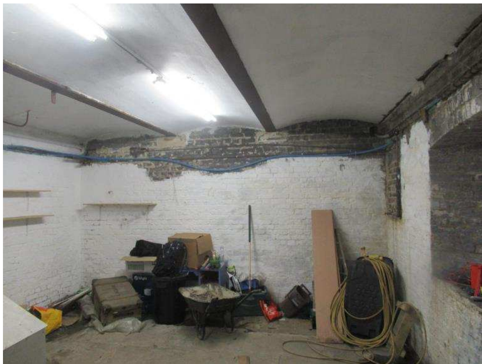
Photoplate 1 – View of Crypt Plant Room

The crypt Plant Room and Flower Arranging area finishes comprise of painted and part natural finish brick walls, uPVC double glazed window to the opening light, painted concrete vaulted soffit with exposed steel I beam undersides, redundant boiler encased in boarding, and solid floor of part stone and concrete infill. Surface mounted lighting and power.