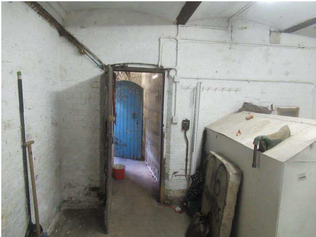
Photoplate 3 – View of Crypt Plant Room facing towards entrance