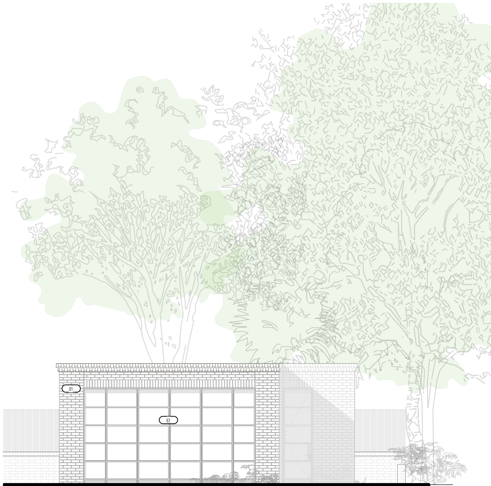
02 - Proposed Summer House East Elevation 1:100 @ A3

First floor extension revised to have flat roof following planning officer feedback