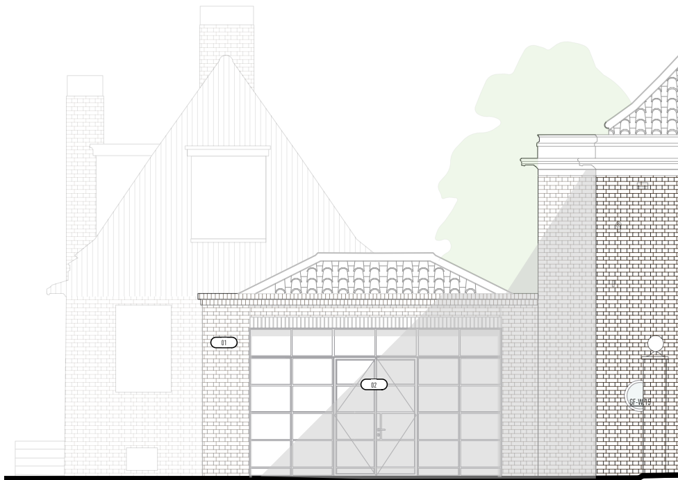
01 - Proposed Kitchen Extension West Elevation 1:100 @ A3